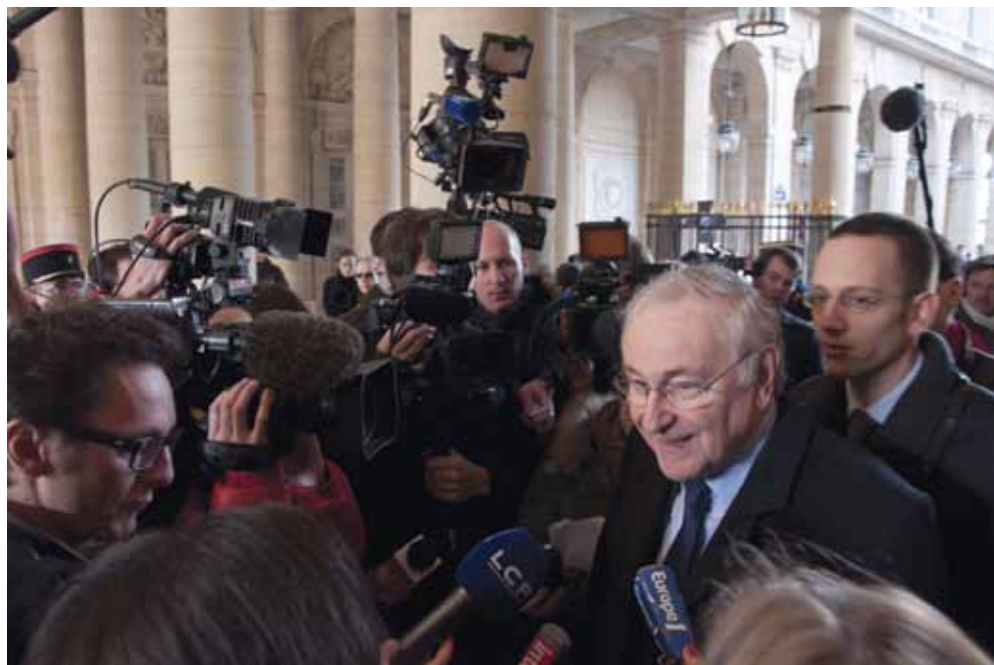
Jacques Cheminade's ironclad commitment to ending the dictatorship of the British imperial financial system has produced a political tsunami in France. He is seen here being mobbed by reporters outside the Constitutional Court in Paris on March 8.

On the issue of video games, in an interview on Canal+ on March 20, Cheminade was asked why he was for prohibiting violent videogames. With a refer-