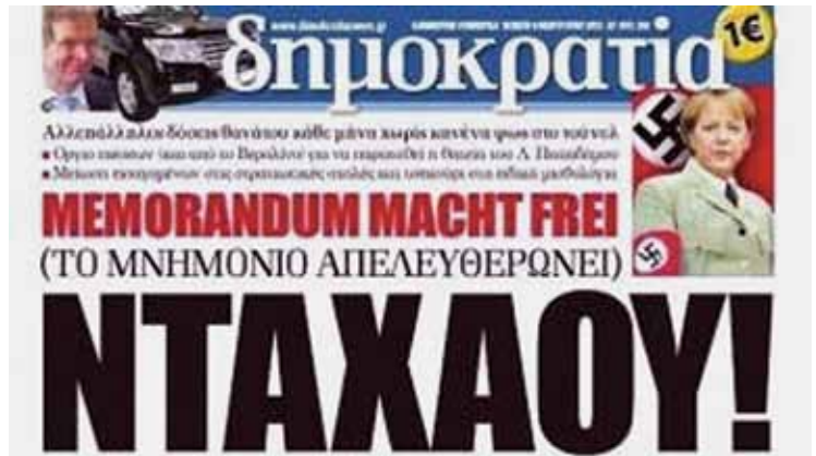
The Greek press is full of hideous caricatures of Chancellor Angela Merkel, like this one in Demokratia on Feb. 10.

The euro is a failed experiment. And now, if there’s an attempt to leverage the European Financial Stability Facility by a factor of ten to one, into a money-printing machine, or to establish the European Monetary System as a de facto permanent bailout mechanism, then this would be the end of our sovereignty and control over our own budget, the so-called “sovereign right of par-