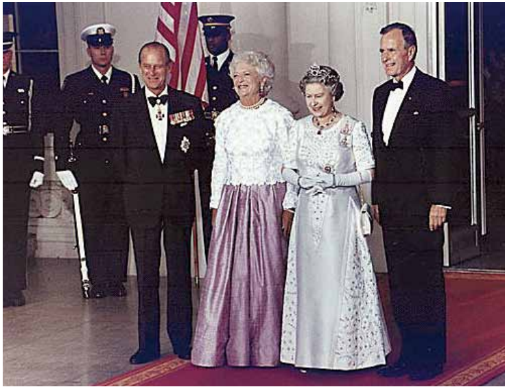
George H.W. Bush Library

President George H.W. Bush and Mrs. Bush with the Royals at the White House, May 14, 1991. Bush and the British decided to create a globalized empire based on the Anglo-American special relationship, after the collapse of the Soviet Union.