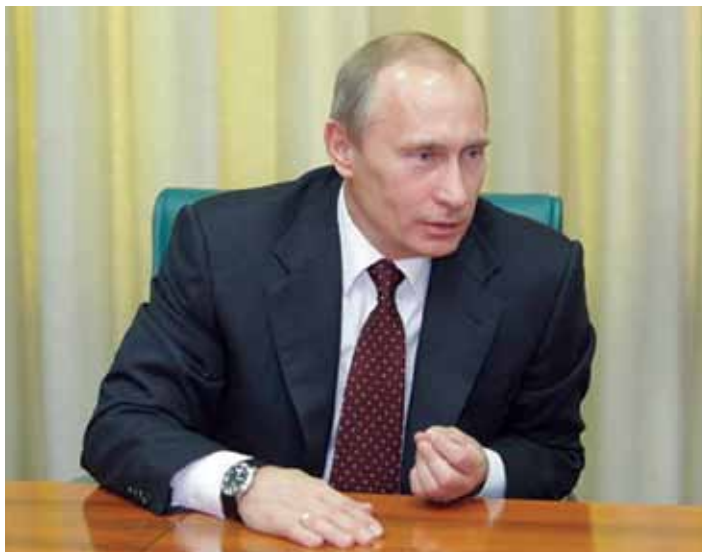
Russian Prime Minister Vladimir Putin talks with reporters about the U.S. deployment of a global missile-defense system, December 2009. Today, Putin is warning that Russia will have an effective and asymmetrical response to this deployment.

In view of this situation, and of course the fact that the European missile defense systems are viewed by Russia as part of the tactic or strategy of encirclement, Prime Minister Putin has just now announced that Russia's military potential will be increased by EU583 billion. He explained that in a world filled with such turmoil, certain forces are tempted to solve their own problems at the expense of third parties—for example, by demanding that resources of global importance be removed from the exclusive sovereignty of individual nations, and this of course refers primarily to Russia's resources, in Siberia and the Far East; that Russia will not go along with such a thing, not even theoretically; that conflicts and new regional and local wars are breaking out repeatedly along the very borders of Russia, intentionally manufactured chaos, undermining the basic principles of international law.