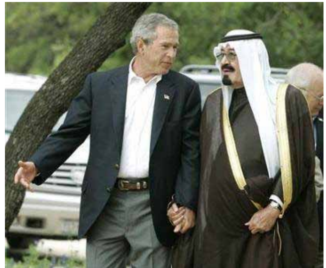
The Anglo-Saudi al-Yamamah apparatus, and Saudi Ambassador to the United States Prince Bandar bin Sultan personally, played a key role in 9/11. Shown are buddies President George W. Bush with Bandar in 2006.

The MEK, under the protection of U.S. military