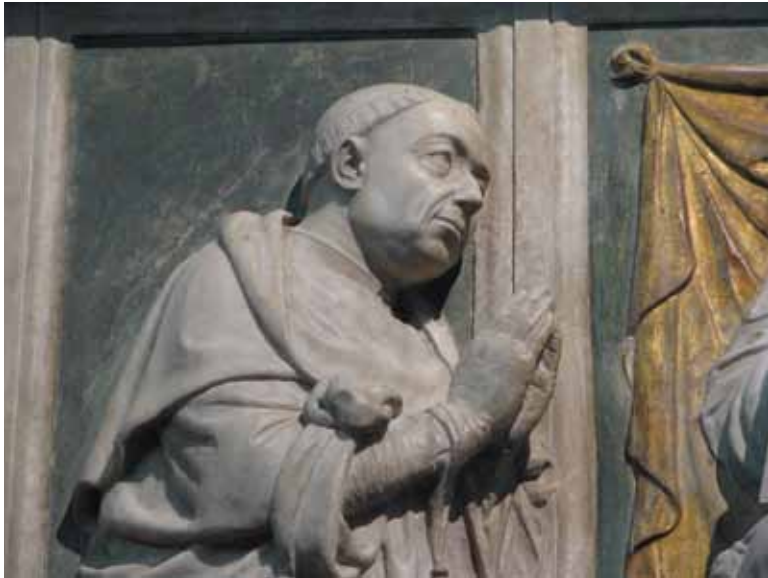
Cardinal Nicholas of Cusa, relief in the Basilica di S. Pietro in Vincoli, Italy. Cusa was the first to discover what we now call the biogenetic law of evolution; for him, this meant that man is only wholly man when he participates in divine reason.

and economic order into agreement with the cosmic order, will we be able to overcome humanity's existential crisis, and the potential extinction of the human species. This necessity corresponds to a profound philosophical principle in the Christian-humanist tradition of European intellectual history. But this idea also exists in other cultures—for example, in the Vedic tradition in Indian philosophy, or, in another guise, also in Confucianism.