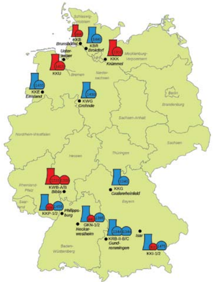
FIGURE 1 Germany’s Nuclear Plants

“Use the G20 as the driving force for a sustainable