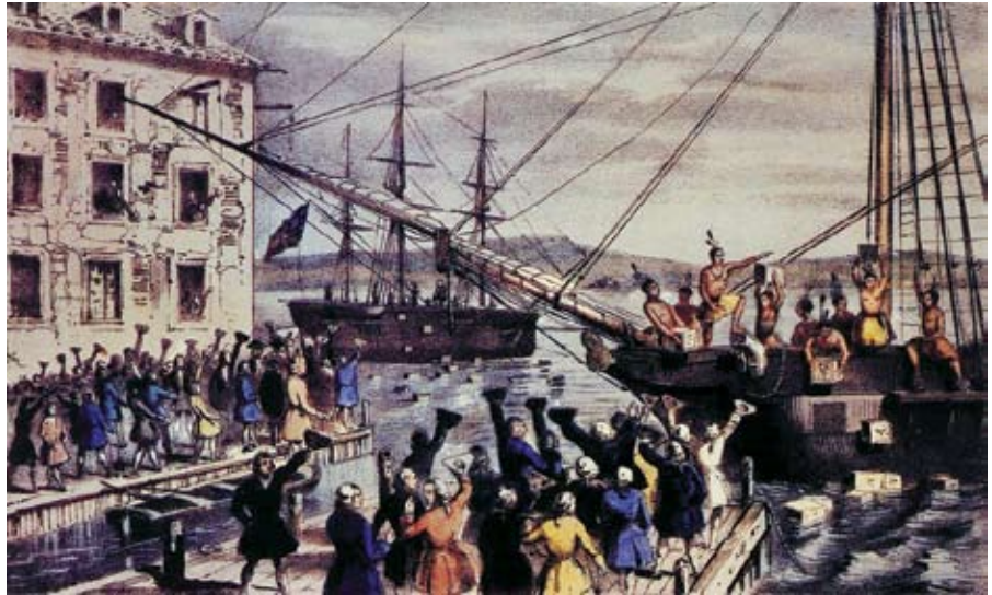
“The Destruction of Tea at Boston Harbor,” lithograph by Nathaniel Currier (1846).

Dec. 16 began with a call for the largest town meeting ever seen, and over 7,000 people came to Old South Meeting House, most not being able to squeeze inside. The main speakers were Sam Adams, Dr. Thomas Young, and Josiah Quincy, Jr. All knew the action to be taken next could draw severe punishment, and likely death.