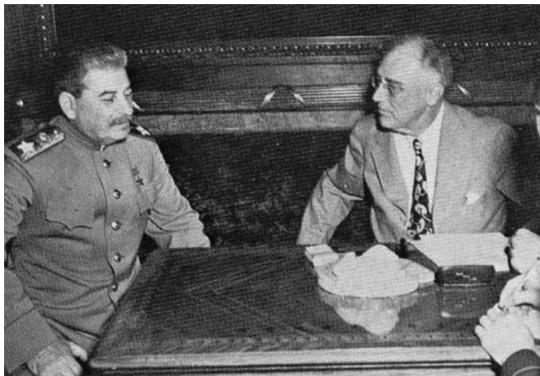
Generalissimo Josef Stalin and President Franklin Roosevelt at Yalta, February 1945. Eisenhower’s naming of Charles Bohlen, FDR’s translator at all the summits with Stalin, as Ambassador to Moscow, was clearly intended to foster trust in the new administration, on the part of the Soviet leader.

According to one source, Churchill felt humiliated by being treated as the “junior partner” once again. Although he was clever enough not to openly attempt to dissuade Eisenhower from meeting Stalin, he advised him to “take a few months to get into calmer atmosphere and learn the facts...” When Churchill returned to London in February, he met with Soviet Ambassador Andrei Gromyko, in an apparently unsuccessful attempt to arrange a meeting with Stalin for himself. Eisenhower’s discussion with Churchill generated discussion in the Foreign Office, which, according to offi-