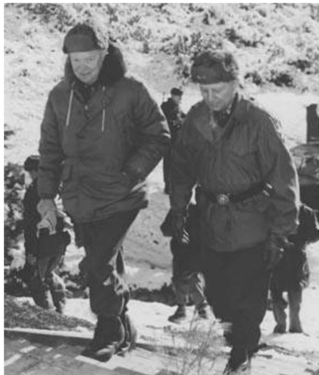
President-elect Dwight D. Eisenhower (left) in Korea, December 1952. He went to Korea to see whether a new approach could be found to ending the war there.

What we present here is only part of the story, but what a story it is!