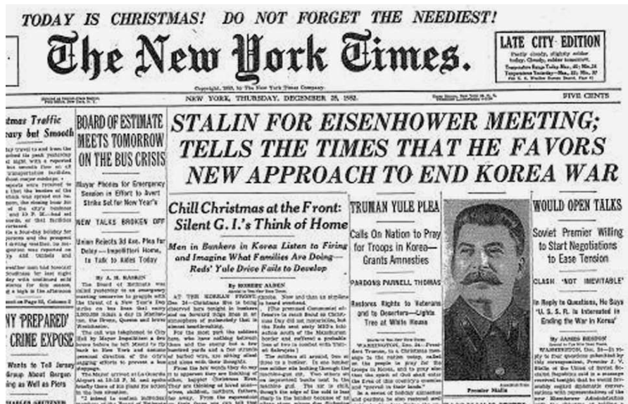
The New York Times’ Christmas Day 1952 interview with Josef Stalin, in which Stalin welcomes the idea of a meeting with Eisenhower. The British were apoplectic.

en route home from the Commonwealth Conference in London, with a message from Churchill, expressing concern about the incoming administration’s Korean policy. “Menzies Quizzes Ike on MacArthur,” was the Christian Science Monitor headline on Dec. 19.