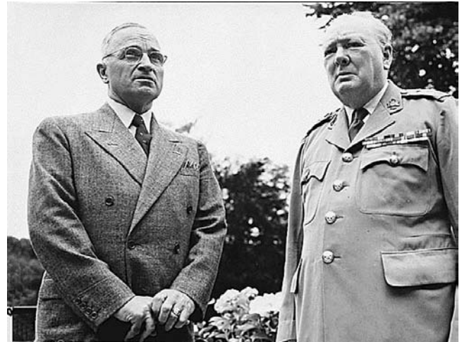
Eisenhower and MacArthur sought to undo the damage done to world peace and Soviet-American relations since the death of Roosevelt and the inauguration of Harry Truman. Shown here are leaders at the post-victory Potsdam summit, July 1945: (left) Josef Stalin and Truman; (above) Truman and Winston Churchill.

the President-elect's current trip was an act of "demagoguery." Truman's press secretary whispered into Truman's ear that it was not very becoming of an outgoing President to accuse the President-elect of demagoguery. This, too, became front-page news.