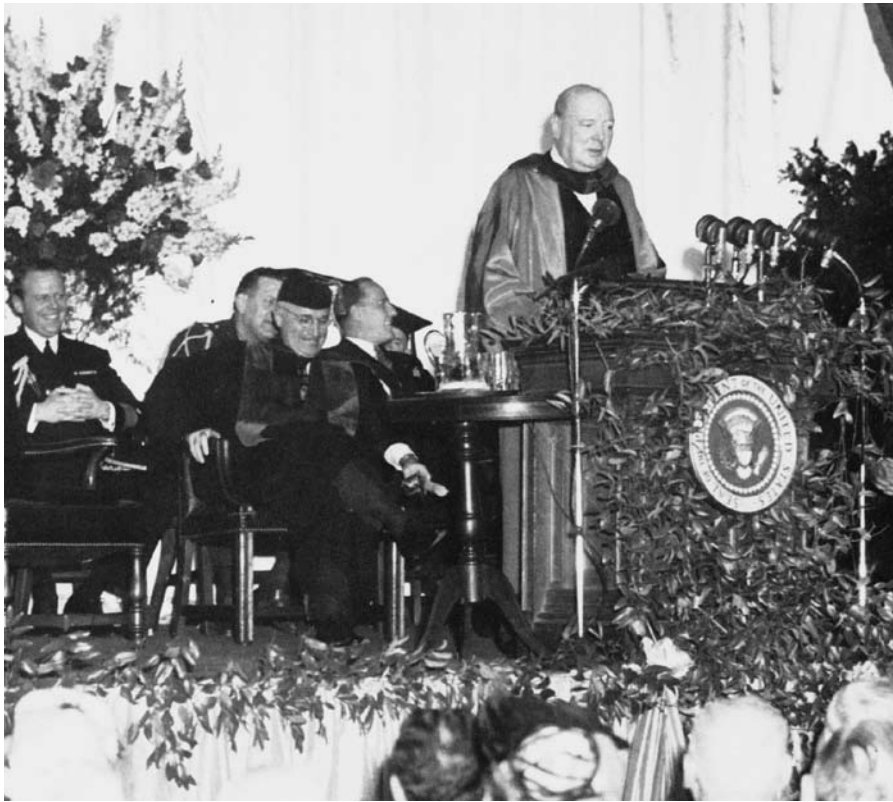
Sir Winston Churchill gives his famous “Iron Curtain” speech in Fulton, Missouri on May 5, 1946. Seated to his right is President Harry Truman, Churchill’s lackey in Cold War politics against the FDR legacy.

partment experts underscored the importance of the fact that Stalin made “personal commitments,” especially when he said, “I agree to cooperate,” which was a departure from previous interviews.