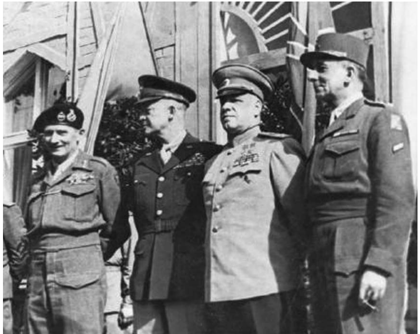
General Eisenhower and the other Allied Commanders in Berlin, June 5, 1945. Left to right: Britain's Bernard Montgomery, Eisenhower, the U.S.S.R.'s Georgy Zhukov, and France's Jean de Lattre de Tassigny. Eisenhower and Zhukov had a collegial working relationship.

On Feb. 27, the Christian Science Monitor published a United Press dispatch from Moscow stating, "Foreign observers here say they believe the Russians would welcome President Eisenhower's willingness to discuss peace face to face with Prime Minister Joseph Stalin. Their best guess is that Berlin could be the meeting place." It further stated that Eisenhower's statement "was expected to receive favorable reaction," and "observers said they believe the likelihood of a meeting