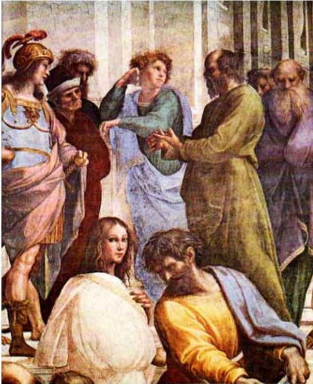
The trial and execution of Socrates (399 B.C.), exemplifies what Aeschylus warned against in his great dramas: the oligarchical principle. Shown: a detail from Raphael's "School of Athens" (1510-11), in which Socrates (standing, second from right) is portrayed teaching.

chical principle, ” technically, in the language of the time: the oligarchical principle. And the objective was, to have a unified empire, between the so-called “Greek” people (they weren’t calling themselves Greeks, then), and the Persian Empire. And the idea was to divide the world between a land-based empire, which would be the Persian Empire, the Achaemenid Empire of that time, and which would be, essentially the river basin, and the eastern part of Turkey, and that area; and, on the maritime side, you would have the maritime power—the Cult of Apollo, essentially would run it. And that was the agreement. Which was screwed up, by Alexander the Great, who made a mess of that. . . .