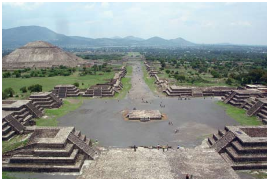
Trans-Atlantic maritime cultures used star systems for navigation. For example, the Pyramids of the Sun and the Moon, which were astronomical observatories, dating from the first half of the first millennium A.D., in Teotihuacán, in the Valley of Mexico. Shown: the Pyramid of the Sun (left, distance), as seen from the Pyramid of the Moon.

Charlemagne's big change was to introduce a new system, based on developing of inland waterways. Now, people, of course, had used major rivers in Europe, before then. For example, up the southern end of the Rhine, you would have mineral excavations occurring