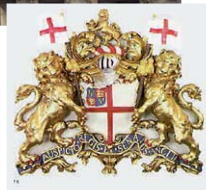
The center of treason in the United States is located on Wall Street and in Boston, in what is known as the “Vault,” a spawn of the British East India Company. Shown: The New York Stock Exchange on Wall Street, which should be flying the Union Jack; inset: the coat of arms of the British East India Company.

corrupt, that you would have to take the best of European culture, and move it to a continent across the ocean! To take that culture, and let it express itself, in a territory out from under the British imperial system or the imperial systems of that time. And that's what we were. And we succeeded.