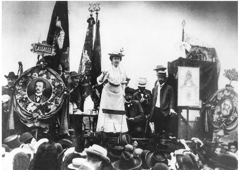
Rosa Luxemburg (shown here, in Stuttgart, 1907) was the only competent economist of the last century. “She was a genius,” declared LaRouche. She was entirely correct in her economic theories, and on the nature of imperialism.

Imperialism is not an expression of a nation-state; it’s an expression of an empire. And empires and nation-states are not the same thing. An empire is a system that is controlled by managing wars among the nation-states which are part of the empire! World War I, World War II are examples.