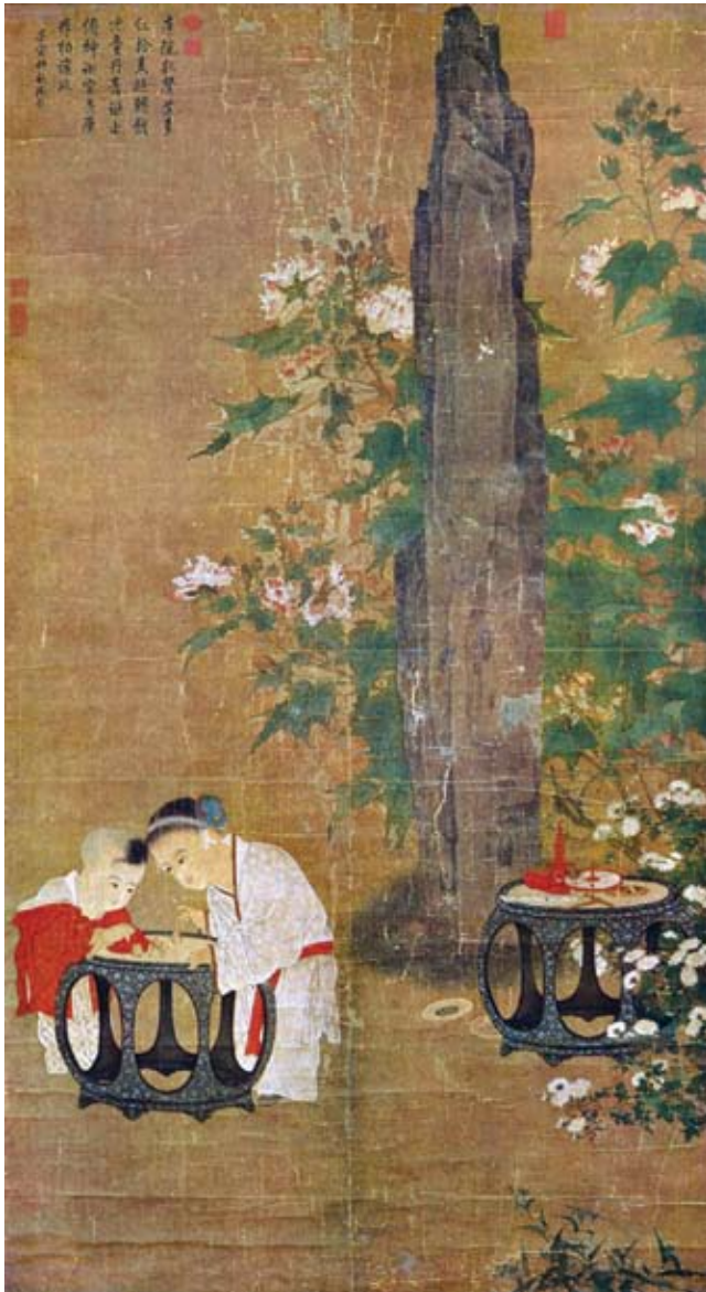
China, said LaRouche, is generally doing the right thing economically. It's a question of culture: "Culture is the ancestors inside you! It's the creative powers of reason in your population, which are expressed with the art, the artistic culture, especially, and the form of language of the population." The painting, "Children Playing," by Su Han Ch'en (Song Dynasty, 1150 A.D.).

pany earlier, which laid the basis for this problem. This is a major problem.