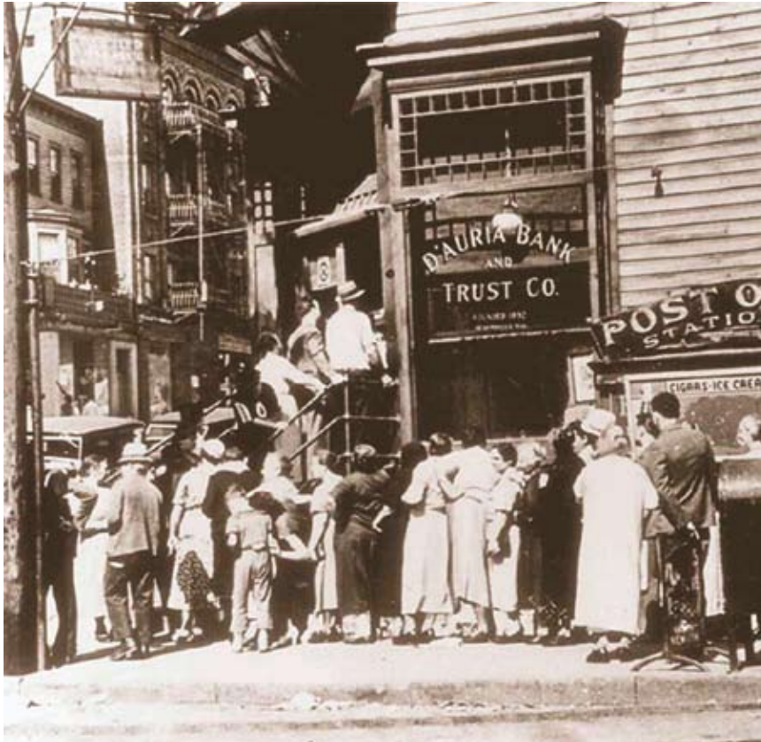
Franklin Roosevelt's inauguration as President, on March 4, 1933, took place in the midst of a bank panic. By June 16, Congress passed the Emergency Banking Act, which included Glass-Steagall, to separate commercial from investment banking. Shown: a run on the D'Auria Bank in New York City in 1933.

So he decided to quit while the going was good.