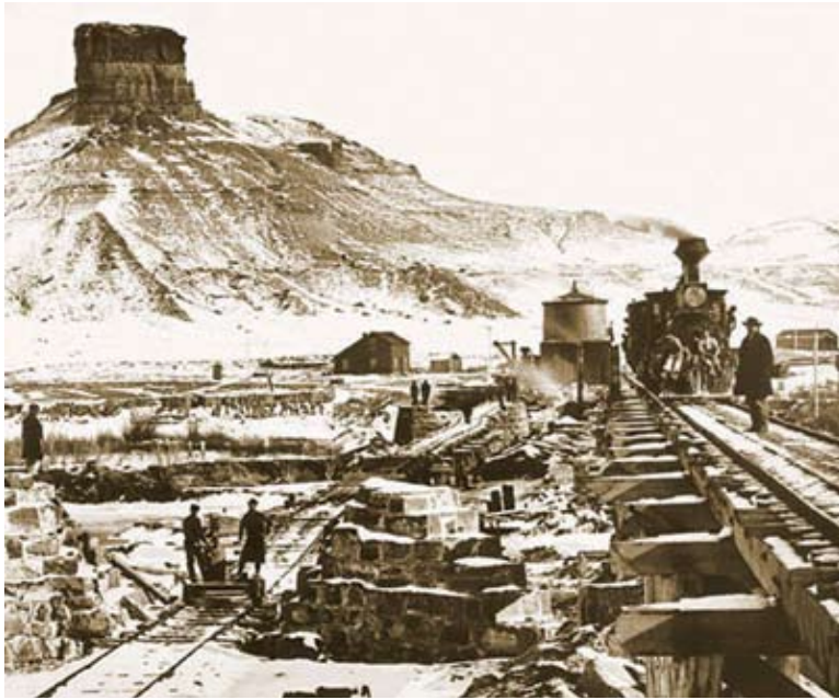
Following the model of Charlemagne's canal systems, we developed canals, and then railroads, to unite the nation, from East to West, and North to South. Shown: the Transcontinental Railroad, which was completed in 1869.