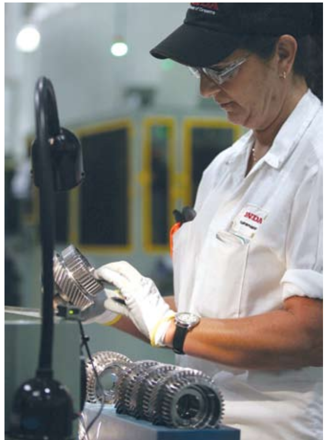
American Honda Motor Co., Inc.

So, we built up, around the machine-tool conception, and the development of multiplying machine-tool