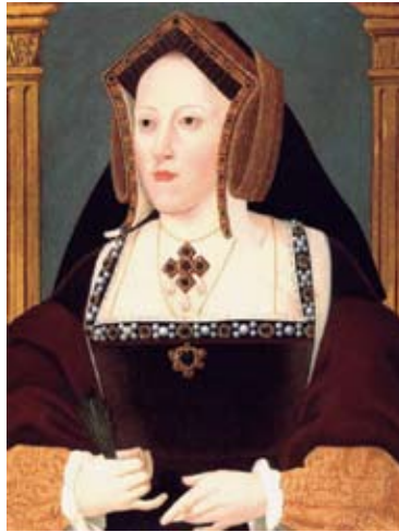
The Venetians played Henry VIII, by orchestrating his divorce from the Spanish Habsburg princess Catherine of Aragon. The divorce was used to set up the division of the Church, leading to a brutal period of warfare in Europe, and, to what became the British Empire. Shown are the painting of Henry VIII by Hans Holbein the Younger (1540); and Catherine, as she appeared in her official portrait as Queen.

you had the establishment of the British Empire. But the British Empire is actually primus inter pares .