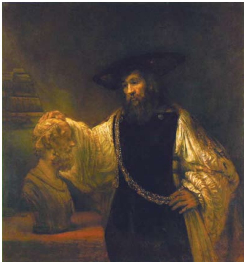
"A bust of Homer contemplating Aristotle," as LaRouche has ironically titled Rembrandt's famous painting (1633). The poet Homer "sees" with his mind, despite his blind, shadowed eyes, this silly fop, "the great, grand, glorious, orator Aristotle," whom Homer recognizes is an ass!

Now, the way the human mind actually functions, and even people who don't know how their mind func-