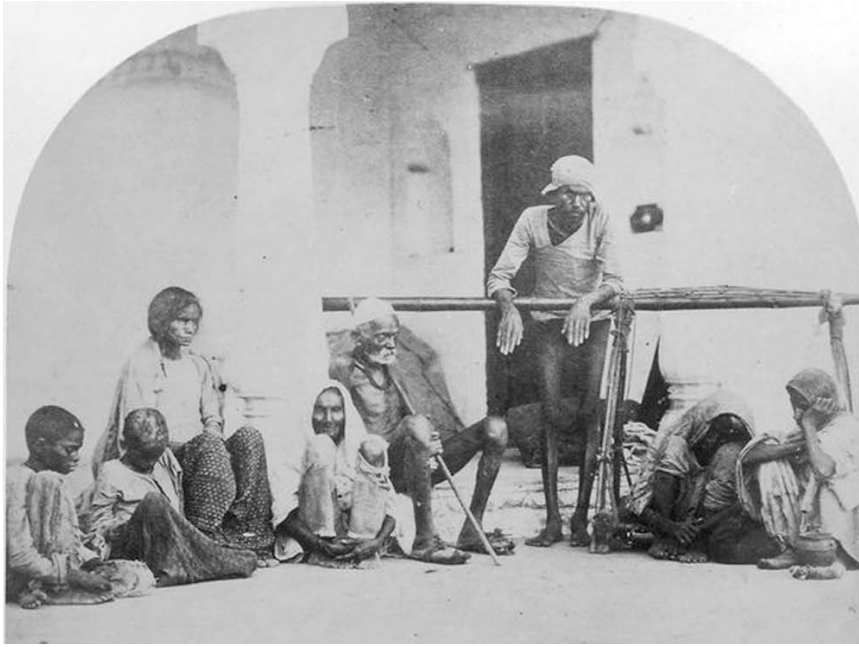
Famine during the British Raj in India (photo from 1868-75): the result of British colonial/Malthusian policies. Viceroy Lord Lytton told district officers, during the 1877-79 famine, to “discourage relief works in every possible way.”