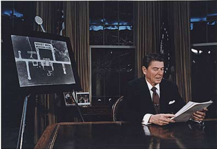
Ronald Reagan Library

President Reagan's March 23, 1983 televised address, where he proposed cooperation with the Soviet Union for mutually assured survival, was a once-in-a-lifetime opportunity for world peace, based on the conception and input of Lyndon LaRouche.