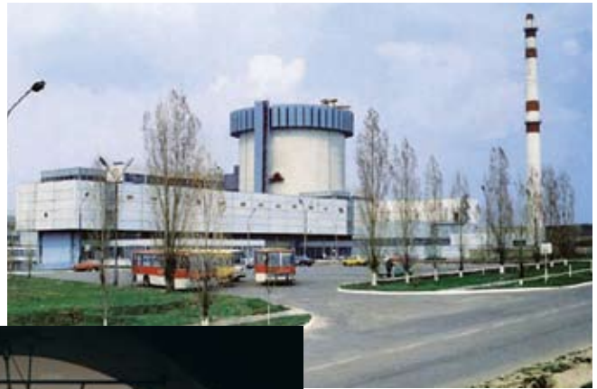
Hong Kong Nuclear Investment Co.