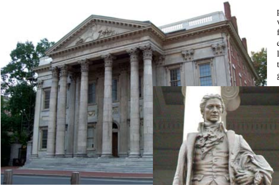
Alexander Hamilton, the first U.S. Treasury Secretary, established the National Bank in Philadelphia, shown here. "Such a bank," he wrote, "is not a mere matter of private property, but a political machine of the greatest importance to the State."

The pathological element which binds together victims such as the G-8 or G-20 as slaves of a London-centered, international monetarist tyranny today, is the prevalent, mistaken belief that money as such is a standard measure of economic value. That is a delusion