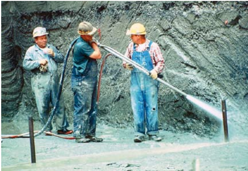
U.S. Army Corps of Engineers

The United States must immediately create millions of productive jobs, like those being carried out by these construction workers at Lake Shelbyville Dam in Illinois. This would combat demoralization, and start the country on the road to a real recovery.