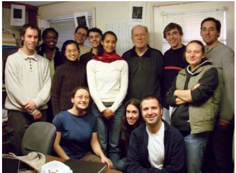
What keeps me going, LaRouche said, is a long-range agenda, one oriented toward both fulfilling the work of past generations, and creating the basis for the success of future generations. At first, this orientation led him to recruit among the Baby Boomers after 1968—as this picture of him from 1973 shows. As the Baby Boomers became demoralized, he moved on to recruit a new generation of youth, dedicated to developing the creativity to save civilization. Here, LaRouche with members of the Basement crew in 2007.

family had, or had been in danger of losing. They went to the best universities, but they felt like an elite, because when the Vietnam War came on, they were able to manage not to get into military service, by being in universities, and therefore, exempt from the draft, until the exemptions got pared down, as we approached 1968. And they were conditioned, culturally, to an existentialist world outlook. And even if they studied science,