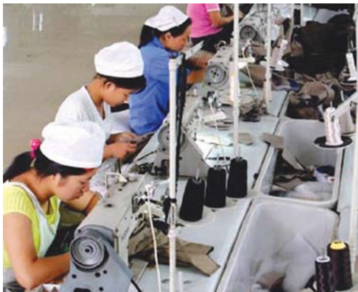
Chinese Embassy to the United States

Despite the changes in government in Japan, the interest of Japan clearly remains: the technology of Japan