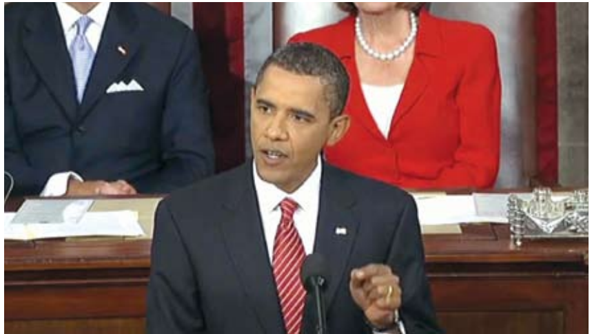
White House video

“All but two states face budget shortfalls for this fiscal year, and the shortfalls are enormous. The fact is, that the Obama stimulus package doesn’t come close to even replacing 25% of that shortfall. If what we are proposing is, in fact, implemented, some can argue that the primary benefits would be macro-economic—saving jobs, preventing program cuts, and making sure that