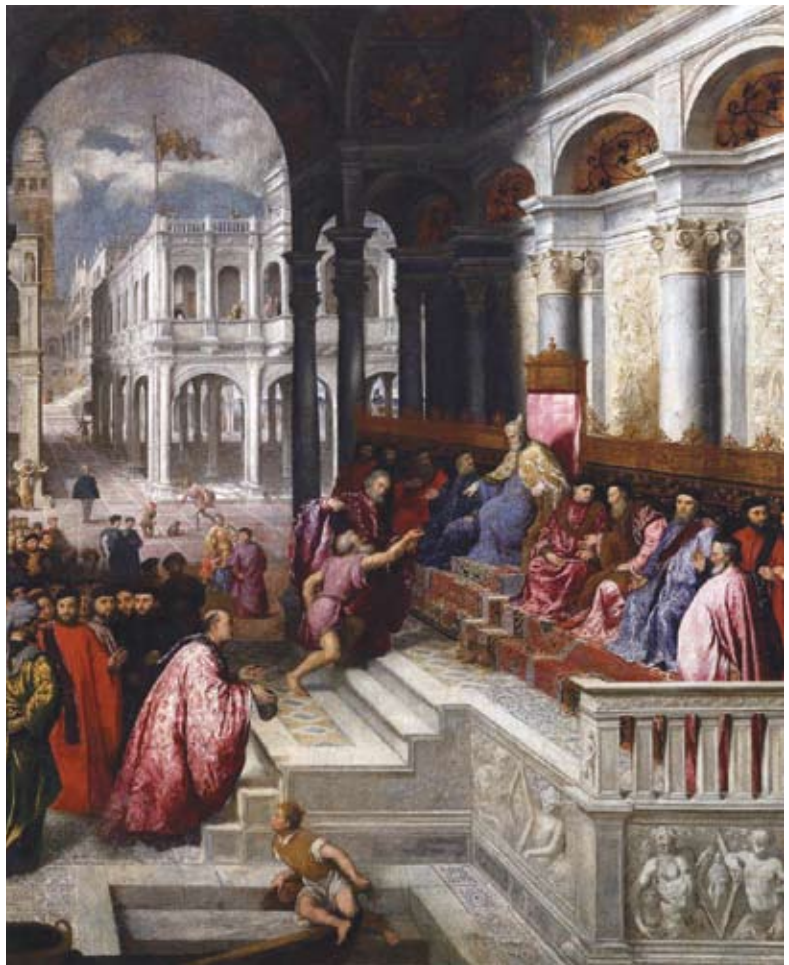
The global monetarist system, which has dominated the planet since the Peloponnesian War, relies on the suppression of national sovereignty, on which competent economics depends. The method used was perfected by the Venetians, who ran the system for centuries, before handing it over to the City of London, which is its capital today. Here, a painting of “The Doge’s Fisherman,” by Paris Bordone, 1534.

“What we have been handed is an alternative to a single-reserve-asset system that would pursue the development of regional monetary authorities, which could, among other things, make dollar-reserve assets earned by countries that are successful net exporters, available to neighbors who are not. Such authorities would have distinct advantages over a global system, because 1) the regional fund has a direct stake in the