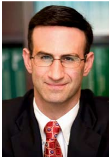
U.S. Congressional Budget Office

This smirking face belongs to Congressional Budget Office director Peter Orszag, the leading spokesman for the murderous Dartmouth Atlas lies that $700 billion can be stripped out of U.S. health-care spending, because it has “no proven outcome.”