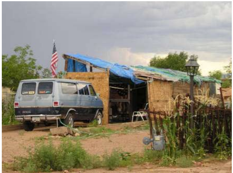
U.S. Geological Survey