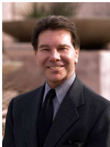
Would you buy a used car from this man? Robert Cialdini considers himself a master of "persuasion."

Who is Rabin? Born in 1963, he is professor of economics at University of California, Berkeley. His cyber name is "Game Boy," and his CV lists his marital status as "In search of a husband." He was educated at the University of Wisconsin, Madison, got a Masters at the London School of Economics, and a PhD at MIT. He