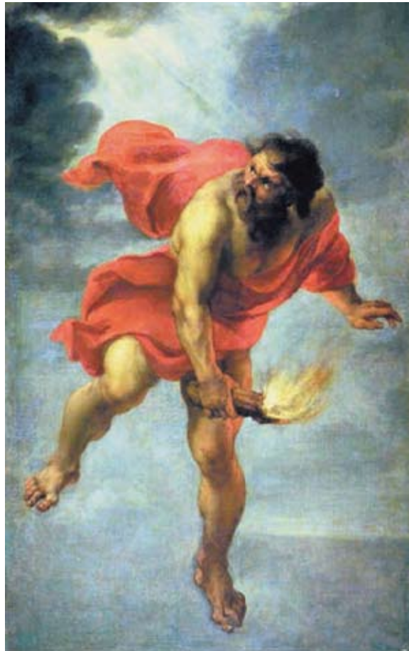
Nations destroy themselves by failing to heed the Promethean principle of scientific discovery, subjecting themselves instead to the evil of the Olympian Zeus: The gods forbid human creativity! Shown, Prometheus, a painting by 17th-Century Flemish painter Jan Cossiers.

Thus, when our subject of discussion has shifted from the abiotic and animal domains, where there is neither guilt nor innocence, to the domain of the Noösphere, science and morality appear in their essential parts as differing facets of the same subject-matter. That