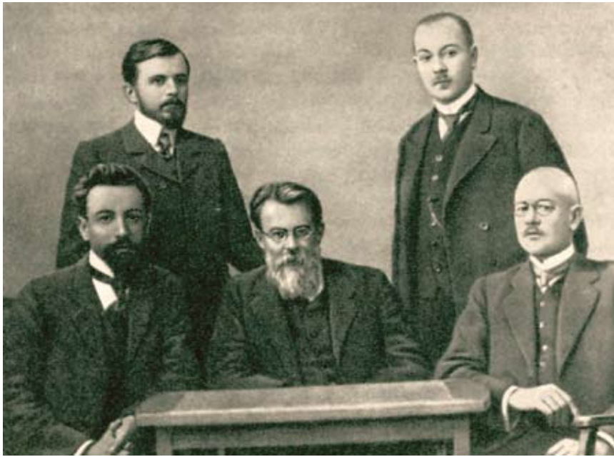
Academician V.I. Vernadsky (seated), with students at Moscow University, 1911. The contributions of Vernadsky (1863-1945), especially his precise ontological distinctions among the abiotic, biotic, and noëtíc domains, contain the clue, LaRouche writes, “to an at least partial, preliminary step in finding an answer to the question of a unified field theory.”

tage-point of methods which presumed man to be defined in his development as to have been a subsumed part of an inanimate process, or from the pathetic presumption that mankind is contained as a product of the domain of merely animal natures.