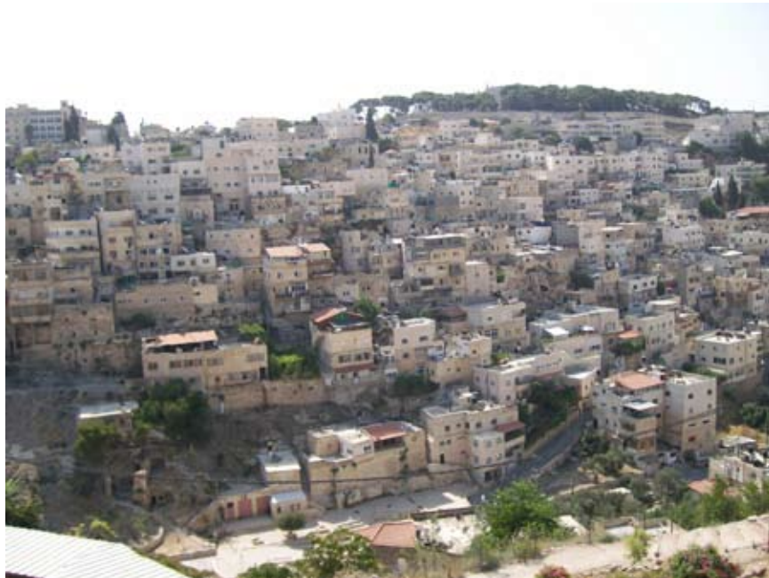
An Israeli settlement on the West Bank as seen from Jerusalem, July 2007. The settlements form a ring around the city, dividing it from the rest of the West Bank.

Israel's continual confiscation of land and resources, together with other daily acts of oppression in the occupied territories, all backed by the United States, undermine any real peace settlement. As recently as De-