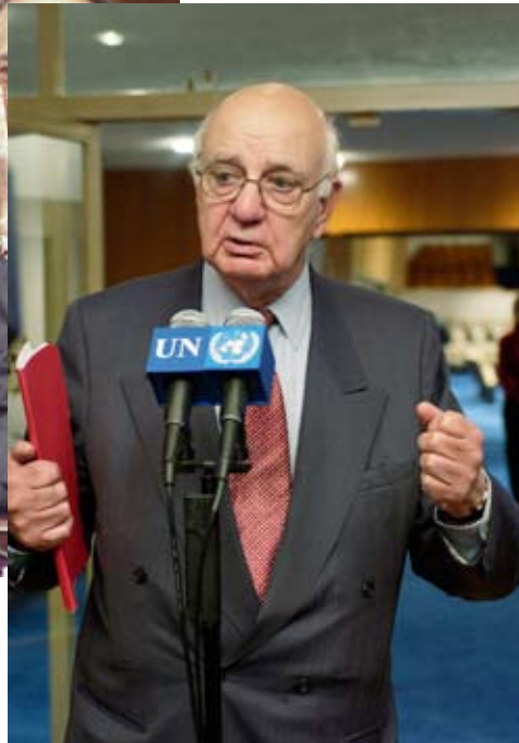
House Financial Services Committee website

The plague of financial derivatives, created by Fed chairman Alan Greenspan (above), shortly after Paul Volcker (right) left office, was the cause of the global financial crisis, of which the subprime mortgage crisis was a symptom.