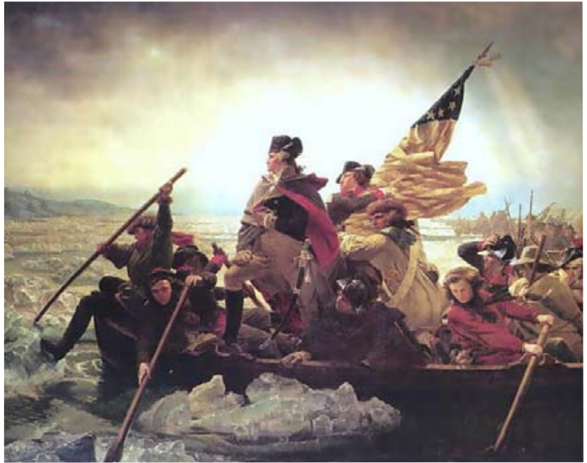
“Washington Crossing the Delaware,” by Emanuel Leutze. From boyhood, Lincoln was inspired by Washington, as he told citizens at Trenton, New Jersey in 1861. “I recollect thinking, boy even though I was, that there must have been something more than common that those men struggled for.”

The danger is, he says, that the Revolutionary War generation is almost gone, and the memories of that struggle “can’t be so universally known, and so vividly felt, as they were heretofore. At the close of that strug-