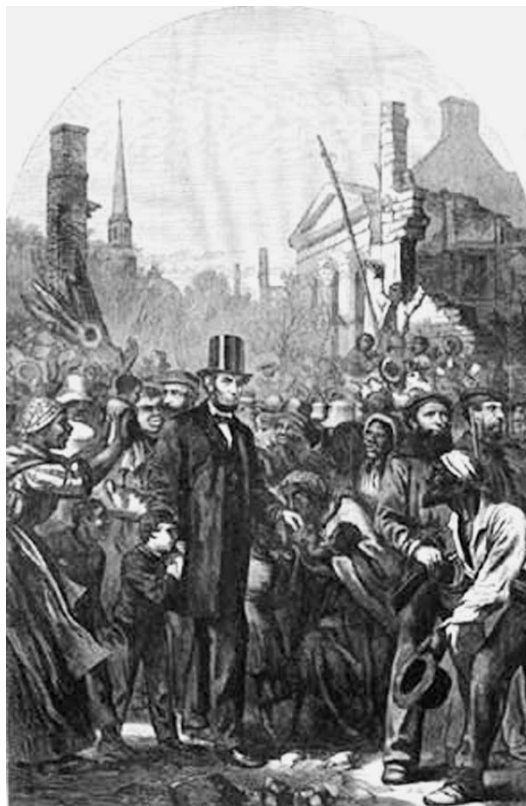
Lincoln entering Richmond, April 4, 1865. He was surrounded by huge, jubilant crowds of freed slaves. “My poor friends,” he told them, “you are free—free as air. You can cast off the name of slave and trample upon it; it will come to you no more.”

If you think of the way that Lincoln set out, you see that he defined the problem in the only way you can define it: We’re not trying to defeat the enemy because it’s evil. I have to do this because the posterity of all time to come depends on it. Everyone who has gotten