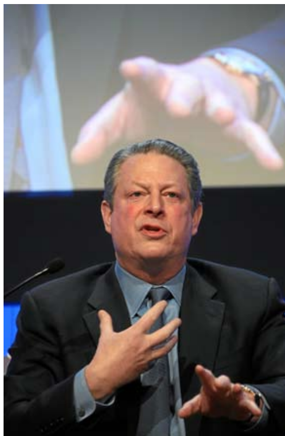
World Economic Forum

The Baby Boomers are not a generation; they are a fraction of a biological generation, chiefly from among those born during the immediate post-war interval 1945-1958, who, like their representative, and former Vice-President Al