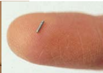
Northshore Medical Accelerator A similar radioactive "seed" treatment is used for prostate cancer. This shows the actual size of a prostate seed implant.