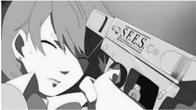
"Persona 3": To "evoke" the powers of your "persona," shoot yourself!