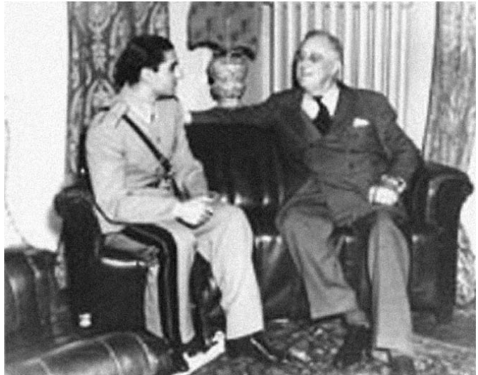
The Shah of Iran and President Franklin Roosevelt, in 1943 at the Tehran Conference.

After this scene, Roosevelt orders a "draft memoran-