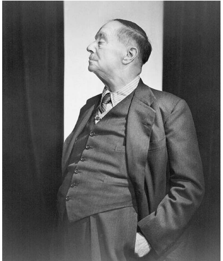
Library and Archives Canada

In what is no mere science fiction novel, but rather H.G. Wells' Mein Kampf , a manifesto of intent, The Shape of