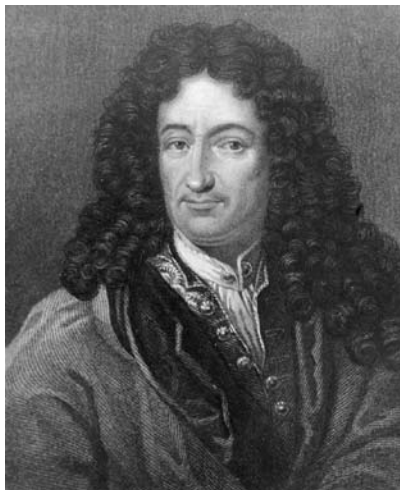
Gottfried Wilhelm Leibniz (1646-1716) urged Peter the Great to set up a Russian Academy of Sciences.

Before the “real” expedition could be launched from the eastern shore of Russia, one first had to get there. That meant travelling across one-third of the globe, over the huge, virtually unpopulated Siberian land-mass, with its hostile climate. As one progressed east, the conditions would get worse and worse, and the people at hand to help out would get scarcer and scarcer. One would be a small army on a forced march through Hell, having to solve ever new problems.