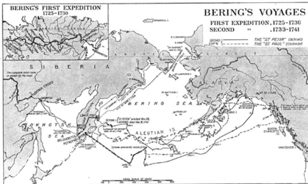
The map shows the first and second expeditions of Vitus Bering, across northern Russia to Okhotsk, and from there across the Kamchatka Peninsula. The second expedition landed in America and determined that Eurasia and America were not connected by land.

with America. They had just gone through the passage we today know as the Bering Strait, and would have seen the American coast, but for foggy weather. Bering then had to decide whether to follow the coastline westward, and try to make it to the Russian outpost of Nizhne-Kolymsk at the mouth of the Kolyma River. That involved the danger of being caught in the icy waters during the Siberian Winter. They decided not to take the risk, and instead turned around and returned safely to Klyuchevskaya Sopka, where they spent the Winter.