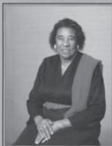
Amelia Platts Boynton Robinson