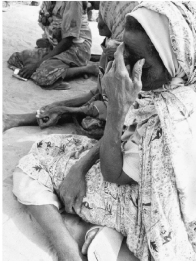
Lord Kitchener’s invasion of Sudan in 1898 has remained “an included, featured pivot of British imperial geopolitics, worldwide, to the present-day in Darfur.” Here, a woman displaced by the war in Northern Darfur.

Among relevant circles in Boston 5 and Manhattan, most notably, the leading intention at that time, and since, has been to assimilate Boston and Manhattan into London, as early as this might be pulled off. The assassination of President John F. Kennedy, and the ruinous effects of the U.S. plunge into the trap of a Indo-China war led, thus, to the near-triumph of what President Eisenhower denounced as the “military-industrial complex” represented, today, by the intimate alliance of Prime Minister Tony Blair, Al Gore, and the Bush-Cheney Administration.