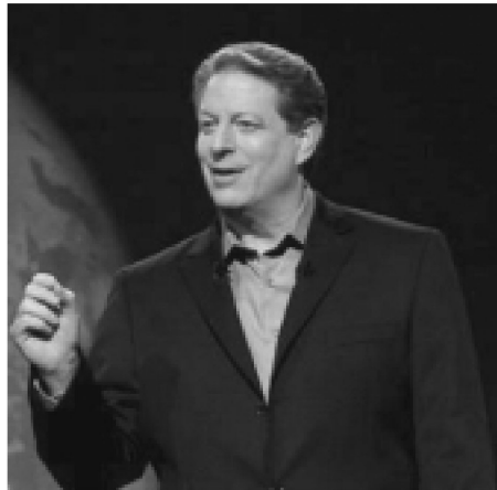
An Inconvenient Truth

peared to represent just a few weeks ago.