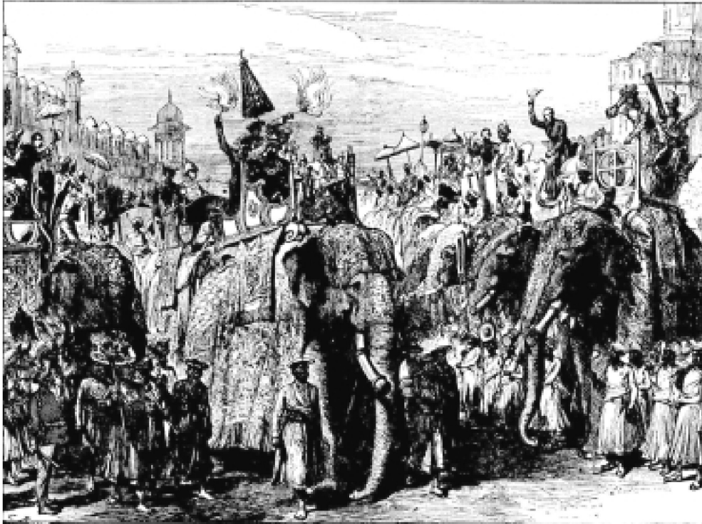
Edward, Prince of Wales, leads a British royal procession in India, 1876. Since the 18th Century, it has been British policy to lure rivals into wars by which they ruin themselves, to Anglo-Dutch Liberal strategic advantage. Later, as King, Edward VII drew the United States, Russia, Germany, and other European powers into World War I.