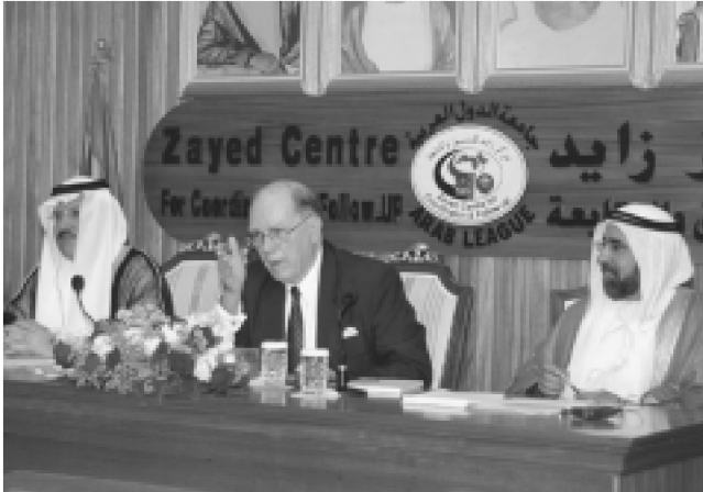
Zayed Centre for Coordination and Followup