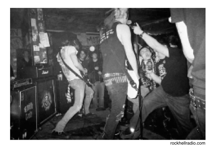
A culture which celebrates men and women degenerating into brain-dead ecstasy, to the loud and pointless beating of drum-like objects, stands in peril of being judged worse than pointless.

arts of both statecraft and the general development of the individual within the social processes.