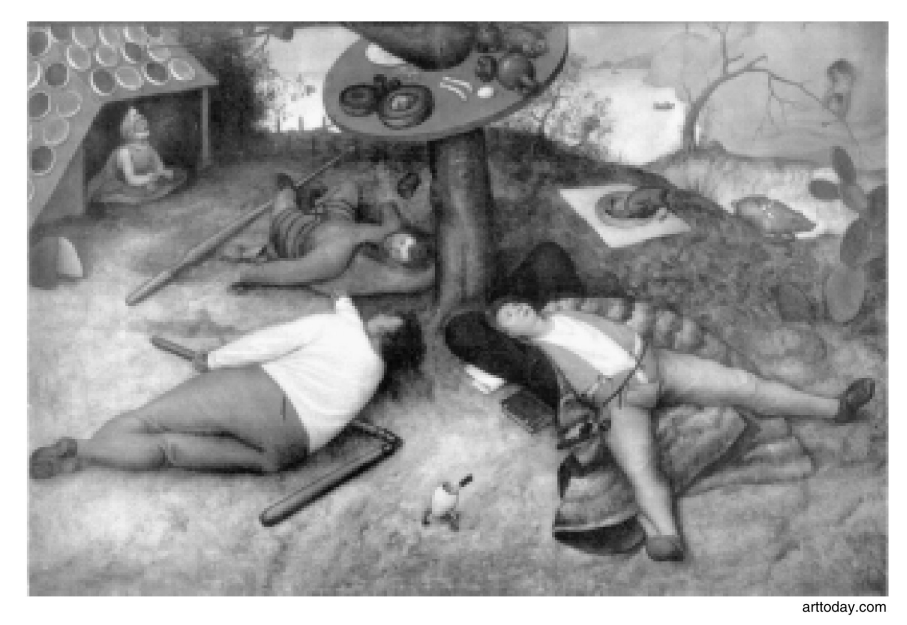
The oligarchical principle treats the majority of populations as virtual cattle, dedicated to nothing but eating and drinking, as this detail from the painting "Land of Cockaigne" by Pieter Bruegel the Elder, painted in the 16th Century, sensuously depicts.

of the Baby Boomer strata, is an explicit ideological extension of the pro-Satanic efforts to suppress Classical science and culture, an effort deployed under the influence of such agencies as the Congress for Cultural Freedom, as by the so-called "environmentalist" movements today. "Environmentalism," associated with the ancient cult of Dionysus, is now expressed as a modern form of intellectual and moral, cultural corruption, whose ultimate objectives are effects on the human mind tantamount to those of enslavement.