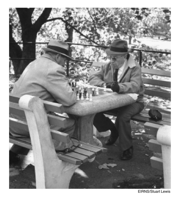
Because the game of chess, shown here being played in New York's Central Park, follows the linear assumptions of Leonhard Euler, it could never be a pathway to discovery of the real principles which run the universe.

Therefore, through the ability of humanity to discover universal physical principles, man is able to increase our power in and over the universe. This shows us the soul as an efficient actor within that universe. Its mortal companion may be in the past, but the efficient substance of the soul is immortal, because it is, in substance, the active expression of a power which is essentially universal.