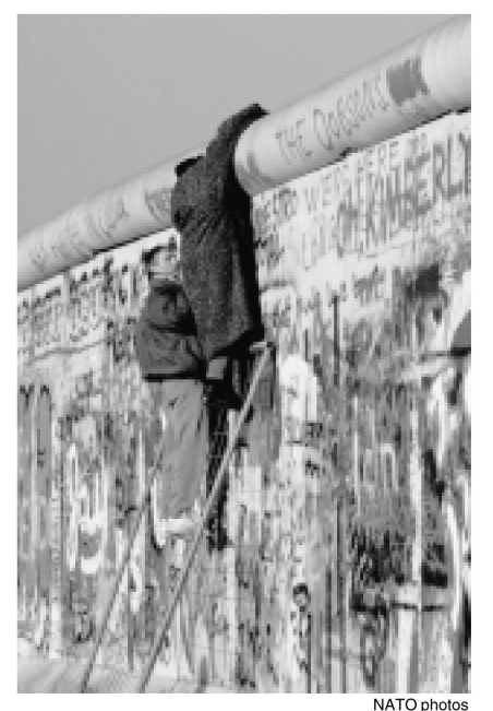
Jubilant Germans scale the Berlin Wall on Nov. 1, 1989, as the Communist regime collapses and the nation moves forward toward reunification, just as LaRouche had forecast the year before.

crucial topic of strategic implications in any capital or financial center of the world.