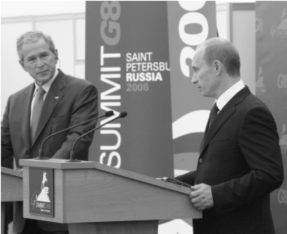
Recent events in Southwest Asia and the Asian subcontinent, taken with the issues already before the G-8 summit, “have lit the fuse of a simmering force of global strategic explosion like nothing which has happened in history before this time.” Here, Presidents Bush and Putin give a press conference on July 15 in St. Petersburg, in the context of the G-8 meeting.

fuller picture. This attack was comparable, in its strategic implications, if not the size of the death toll, to what struck New York City on September 11, 2001. The principal targets of the coordinated attacks were the first-class coaches of trains leaving Mumbai. The number of reported dead, so far, is significantly less than those who died in the attacks on New York’s World Trade Center, but the effect was clearly intended to be comparable, and, given other developments around the world ongoing now, the strategic effects would be much worse than those of “9/11,” unless action to prevent such an outcome were taken now.