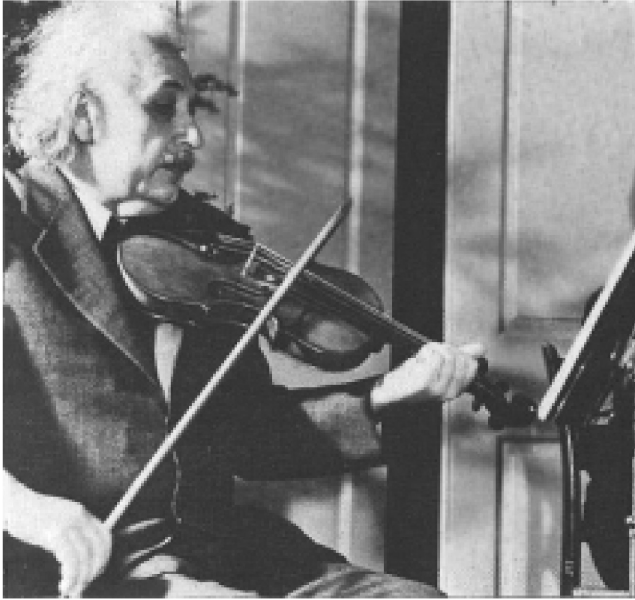
Albert Einstein. “Dry-as-dust mathematical minds dream in black and white; able Classical musicians prefer to dream in color, as do great scientists who prefer Classical music.”

as the Venetian bankers who created the New Dark Age of Europe’s Fourteenth Century.