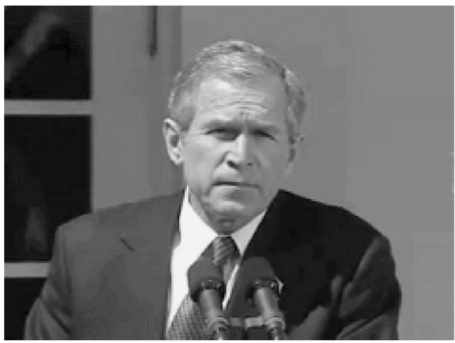
White House/Monty Haymes