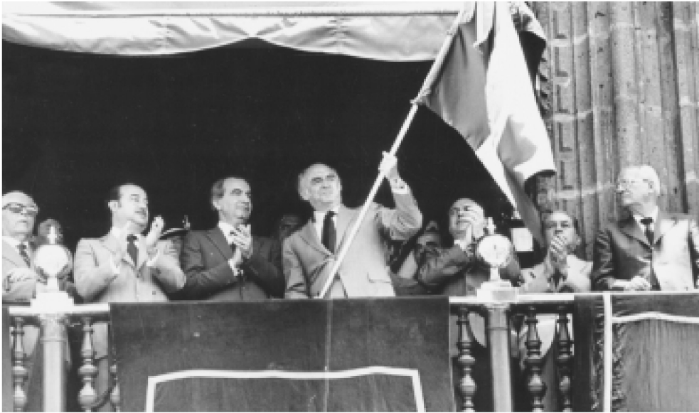
Mexican President José López Portillo hoists the national flag at a Sept. 3, 1982 rally in support of nationalization of the banks. Mexico was left isolated by other Ibero-American governments, and López Portillo's initiatives were crushed.