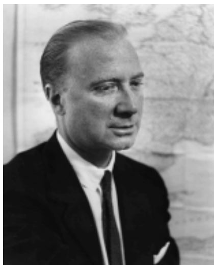
Albert Wohlstetter in a university photo from the 1960s.

Unlike other nuclear strategists and Dr. Strangeloves, Wohlstetter writes relatively clearly, though tediously and exhaustively logically, often using statistical arguments to "prove" his points. He has no understanding of physical economy or of development, just crude cost-benefit analyses. His view of human beings in all this is that of a grade-B cowboy film—good guys versus bad guys, where everything possible