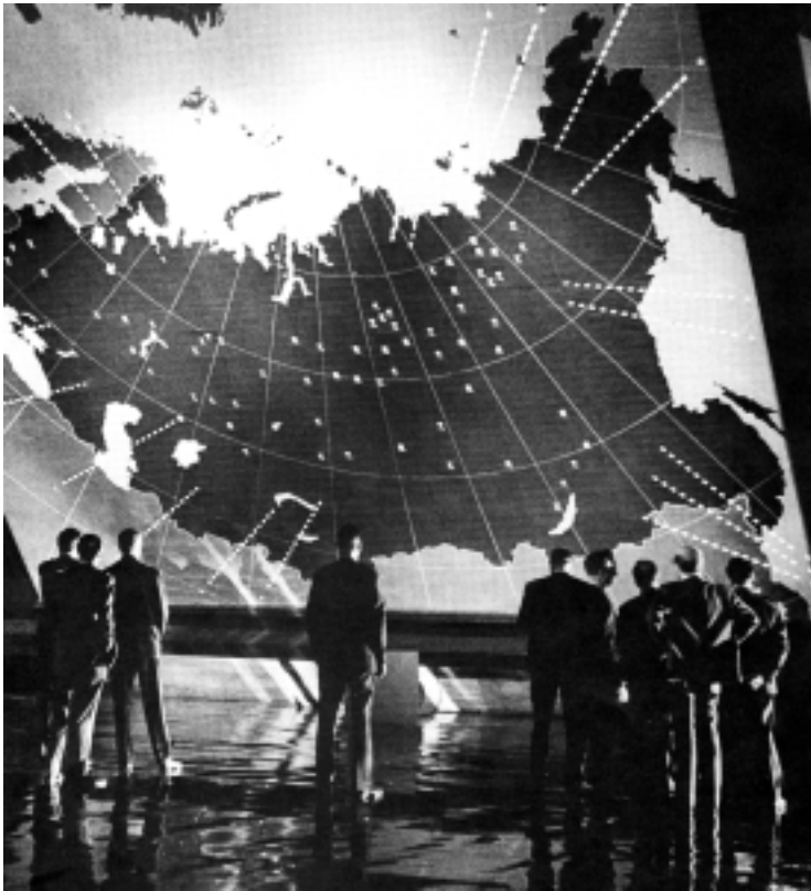
Wohlstetter was even stranger than the “Dr. Strangelove” depicted in the 1964 movie of that name. An early draft of the film was titled “The Delicate Balance of Terror,” the same title as Wohlstetter’s best-known unclassified work. Here, a still from the film.

for industry, Wohlstetter marshalled his math to stop civilian atoms.