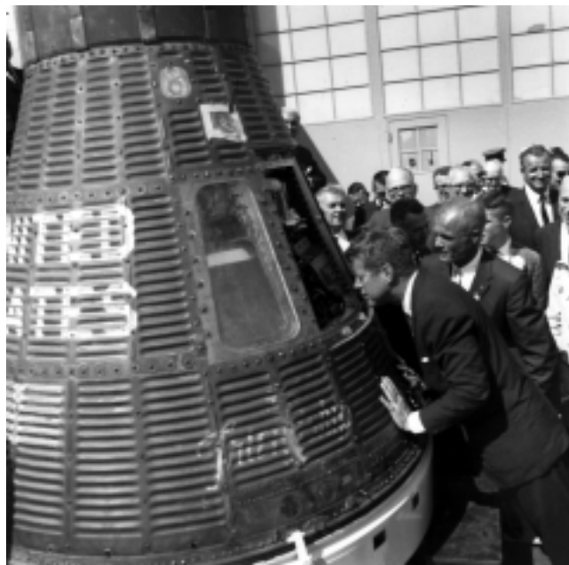
John F. Kennedy Library

For the Democratic Party to invoke the policies of Presi-