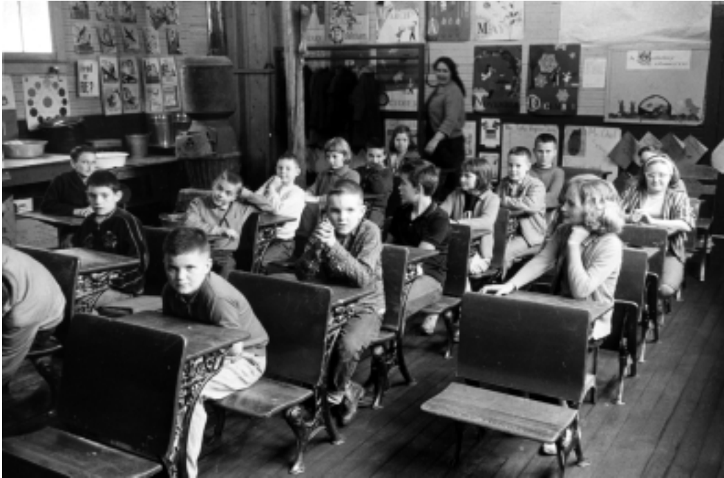
U.S. Department of Agriculture

“Our progress as a nation can be no swifter than our progress in education.” Here, students at a two-room school in Hurricane Gap, Kentucky in 1966.