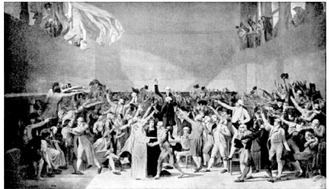
The French National Assembly taking the "Tennis Court Oath," on June 20, 1789 (painting by Jacques-Louis David). They vowed not to move from the spot, until agreement on a Constitution had been achieved. The decision by the U.S. Democratic Party leadership to promote science, education, and growth, based on innovation and "creative disruption" by the nation's youth, represents such a turning point.