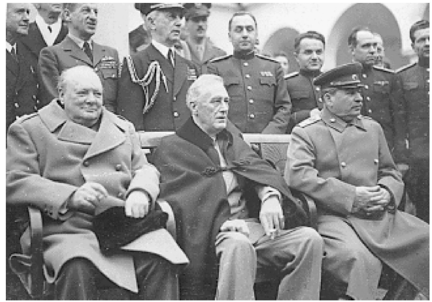
Library of Congre