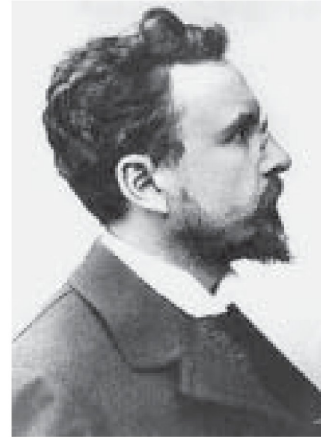
German Chancellor Otto von Bismarck: Kaiser Wilhelm II's discharge of Bismarck was the first major, preparatory step, by Germany, toward implementing the scheme of Britain's Prince of Wales (later King Edward VII) for what became World War I.