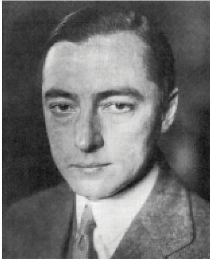
Richard Count Coudenhove-Kalergi was employed by the Synarchist International in the effort to install a fascist government in Germany. He later emerged as the leader of Pan-Europa.

The relevant Twentieth-Century, British view of the U.S.A. as an adversary, had been exhibited already in the naval parity disputes of the immediate post-World War I period, when the British plan for the Japan naval attack on Pearl Harbor was hatched as part of the plan for a naval alliance of Britain and Japan against the threat of U.S. naval power's development.