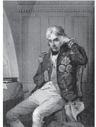
Adm. Horatio Nelson, who beat Napoleon at the Battle of Trafalgar, advancing Britain's geopolitical control of the continent.

The Battle of Trafalgar, Oct. 21, 1805. Once Britain's Admiral Nelson had won the crucial battle there, Napoleon was bottled up within continental Europe, where his role was to bleed France itself almost to death, while destroying the other nations of the continent.