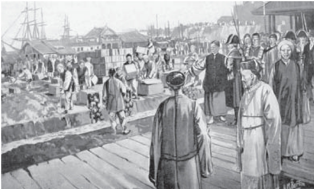
The British Empire was initially established as an empire of the British East India Company, which looted China by means of the opium trade. Here, Chinese authorities are shown fighting back by destroying an opium crop. Britain responded to such insubordination by waging the Opium War of 1839-1842.

practice. rooted in the model of the Seven Years' War, which had been the original source of the recurring mortal conflict between the future U.S.A. and the British Empire.