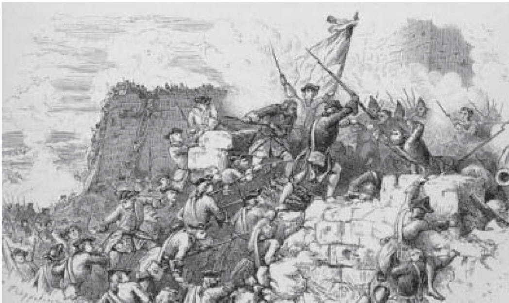
During the Seven Years' War (1756-1763), the Anglo-Dutch Liberals battled to control the nations of continental Europe, and to maintain colonial rule in North America. The war concluded with the Treaty of Paris in February 1763.

Since the Anglo-Dutch Liberals' imperial triumph in the Seven Years' War, new wars based on that model had been the continuing chief source of the repeated ruin of the continent of Europe, and of Eurasia. It was this British policy and its