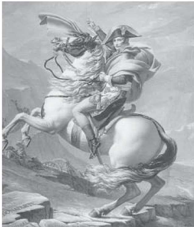
Although some people, still today, consider Napoleon Bonaparte as a hero of modern France, he was in fact a creation of the Martinists and Robespierre—and the predecessor of Adolf Hitler. Here, "Napoleon Crossing the Alps," by Jacques-Louis David.

The British assets associated with the anti-Leibniz circles of Shelburne's operations in France, included not only the