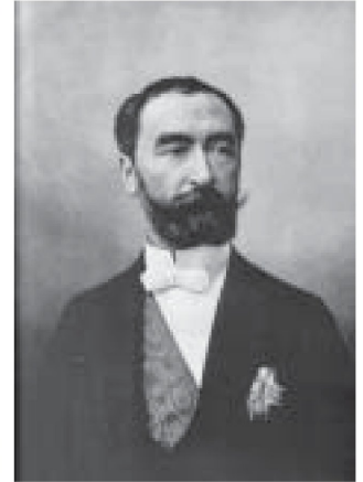
With the 1898 defeat of France by Britain at Fashoda, the residual patriotic forces remaining in France after the assassination of President Sadi Carnot (right), forces represented by Foreign Minister Gabriel Hanotaux (left), were pushed out, leading to the power alignments that put World War I into motion.

preparatory step, by Germany, toward implementing that Prince of Wales' scheme for what became World War I.