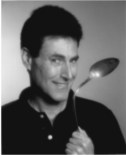
Uri Geller Press Pictures

Uri Geller, the legendary Israeli "spoon-bender," worked for U.S. intelligence in the 1980s, and has now reportedly been brought back.