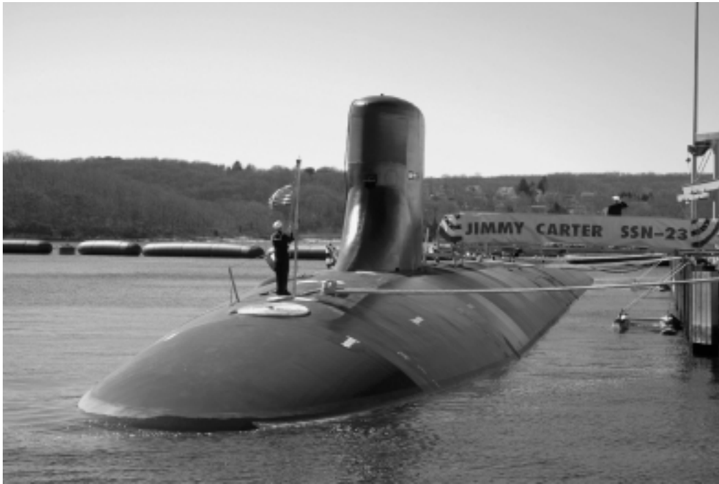
Department of Defense

Nuclear submarine repair and maintenance at the New London/Groton Submarine Base in Connecticut. The Pentagon's move to shut this major base has generated shock and great opposition.