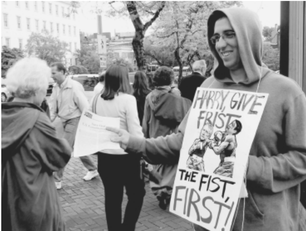
LaRouche Youth Movement “Day of Action” in Washington, D.C. on May 23, the day of the historic agreement to avert the “nuclear option” in the U.S. Senate.

its will on behalf of reason and on behalf of responsibility. We have sent President George Bush, Vice President Dick Cheney, and the radical arm of the Republican base an undeniable message: Abuse of power will not be tolerated, will not be tolerated by Democrats or Republicans. And your attempt—I say to the Vice President and to the President—to trample the Constitution and grab absolute control is over.”