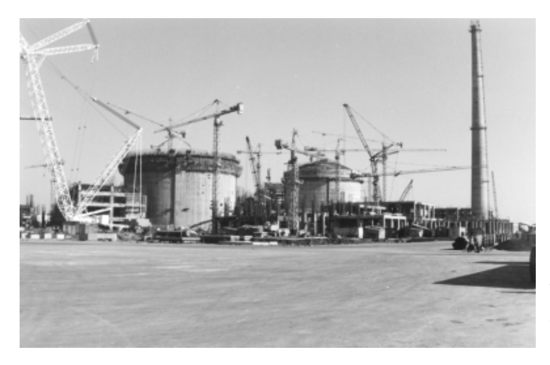
The first of India's pressurized heavy water reactors, a 540-MW unit, located at Tarapur. A second unit will be commissioned there this year.