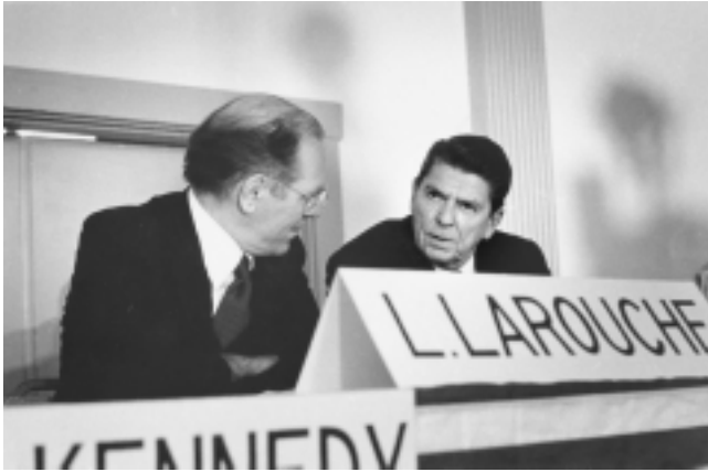
Lyndon LaRouche speaking with President Reagan during a candidates debate in Concord, N.H., during the 1980 Presidential campaign.