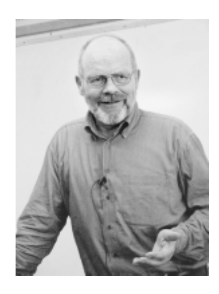
Col. Jürgen Hübschen (ret.) called for the creation of an international task force for the reconstruction of Iraq, in which each country would specialize in one area—railroads, dams, health care, civil administration, and others.

also still has a lot of its money in the United States. And if they take that out, that might also affect the economy here.