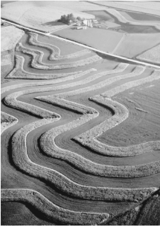
Alternating strips of alfalfa with corn on the contour, to protect this crop field in Iowa from soil erosion, is a means by which man helps nature do better than it could have without man's intervention.