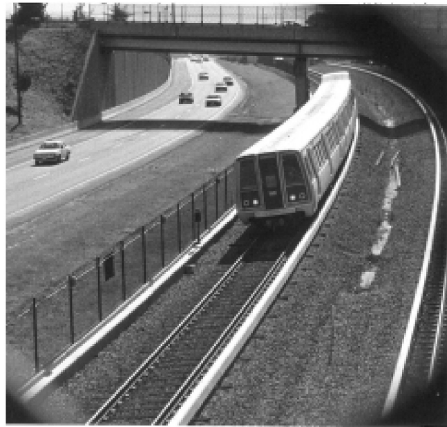
Mass-transportation by rail, as shown in this picture of the Dulles rail corridor outside Washington, D.C., exemplifies the second class of infrastructural improvements which man creates.

society to that individual and family which is threatened by the prospect of avoidable death or simply serious illness. The standard for putting an animal out of its misery, if applied to human beings, puts the human target of that ideological standard of practice into the same category as a mere animal, and also imposes a loss of the sense of humanity in the persons who do that targeting of their fellow human being. Both the victim, and the persecutor are dehumanized. Our society, our nation, has been dehumanized over the recent two generations in that manner and degree which the malthusian ideology of the "living will" expresses.