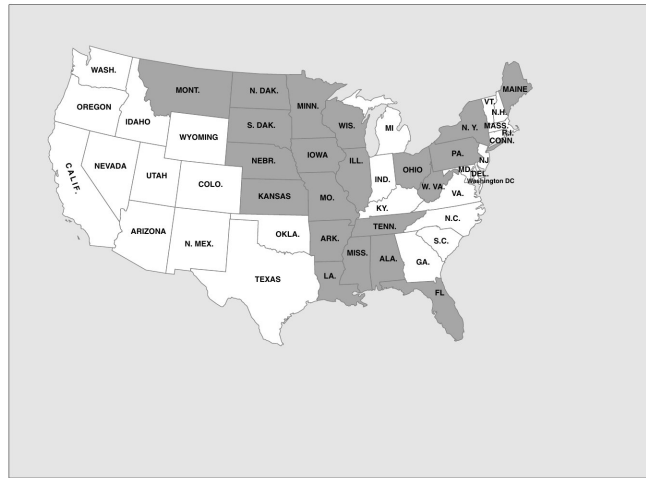
FIGURE 1.2 1980: 22 States Had Federal Legislated Minimum Hospital Beds Per 1,000