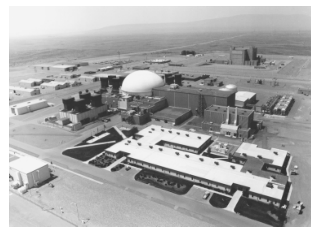
The Fast Flux Test Facility at Hanford, near Richland, Washington. The white dome is the containment building for the 400-megawatt multipurpose test reactor.

millions of dollars proffered by this company to buy the FFTF as "government surplus," the DOE said "no" to the offer in 2004. The DOE is standing by its decision to kill the FFTF.