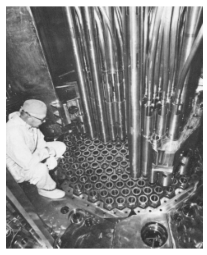
The FFTF fuel assembly grid (below) with reactor operating equipment (above). Pelletized fuel of mixed uranium-plutonium oxide is stacked in a 3-foot column inside stainless steel tubes to form fuel pins, which are arranged in 217-pin assemblies for insertion into the core. Samples of nuclear fuel and other breeder reactor materials are placed in the core for testing.

with other options, cannot significantly offset FFTF operating costs. . . . In view of the substantial cost savings resulting from a shutdown of the FFTF, and particularly in view of the intense competition for limited budget resources, the Department cannot justify FFTF's continued operation, and regrettably its shutdown is our only prudent course of action."