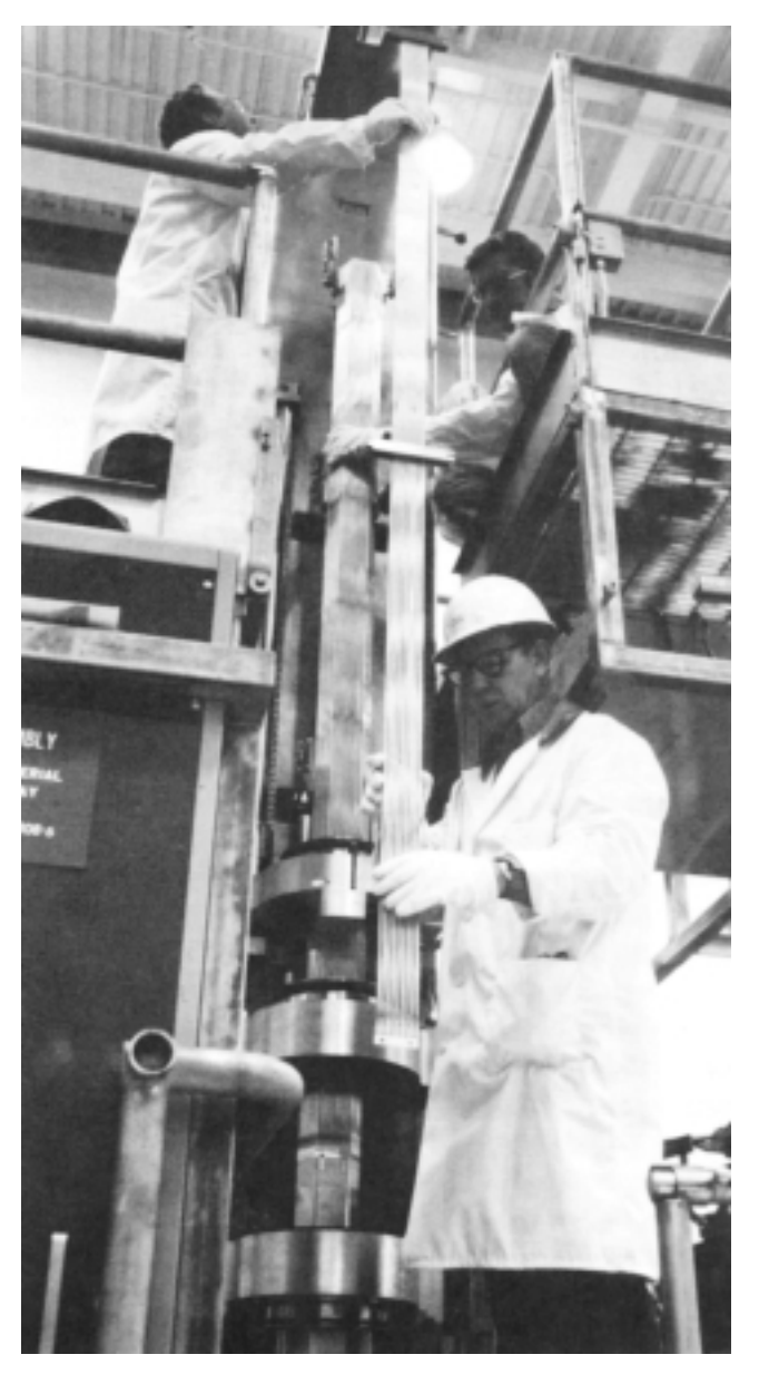
FFTF technicians working on a fuel assembly. Each fuel pin is less than a quarter-inch in diameter and about 8 feet long. The fuel pins are gathered into 217-pin assemblies, like the one shown here, which are housed in hexagonally shaped ducts in the reactor core

The Reagan Administration continued Carter's antibreeder policy, by "privatizing" the breeder to death. Without some form of government support, and in an increasingly hostile environment, no individual company was willing to invest in developing a demonstration breeder reactor, especially given the well-funded and growing anti-nuclear envi-