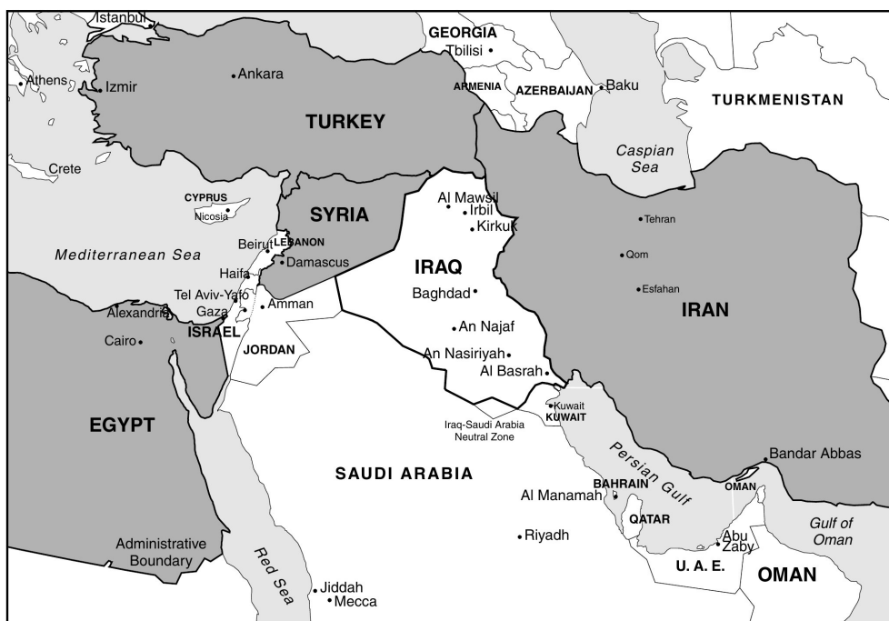
The countries highlighted here are the four principal states identified in “The LaRouche Doctrine,” whose cooperation is required to create a zone of stability in the region as a whole.

was made by Dante Alighieri, on his correlation between the definition of the function of language, of the national language, and the function of the nation-state, as in his De Monarchia .