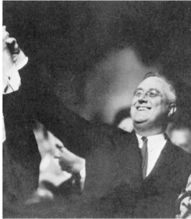
Franklin D. Roosevelt: "He didn't change anything in the Constitution, he upheld the Constitution."

On the other ones—let's take them in reverse: Don't believe in the free market. I know about the free market. First of all, and what we have to do in this, as in some of the cases that were raised by our friend from France, we get away—when we start to talk about economics, I've talked about things that assume economics, we tend to wander to insanity, because the current ideas about economics in the world, are