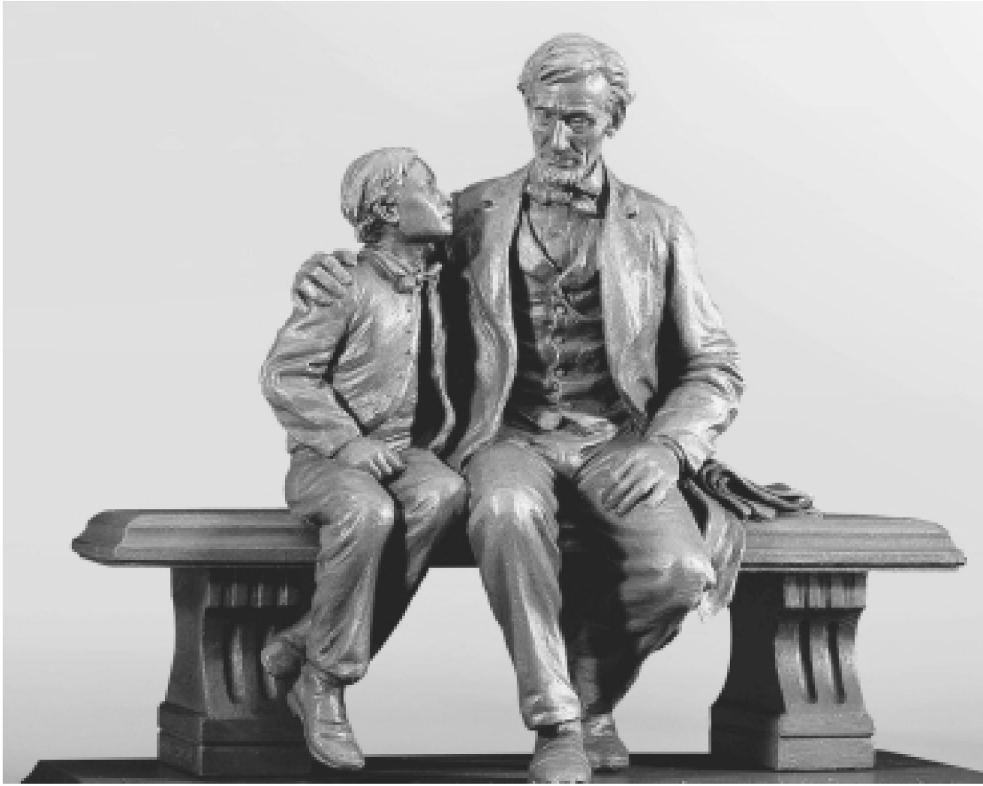
A revolutionary: Abraham Lincoln, shown here with his son Tad, in a statue in Richmond, Virginia commemorating his visit there at the end of the Civil War, April 1865.

Imagine the effect—because the next target in line, is Saudi Arabia! Now Gulf oil, what’s the cost of Gulf oil, as opposed to petroleum from other parts of the world? This region has an 80-year supply! At present rates. Known supplies. (What does Russia have, in terms of supply? What about the North Sea oil?) This is one of the richest, most long-lasting, cheapest parts of the world! Now what happens if you destroy the whole region? What happens to the price of petroleum? What happens to the economies of the world?