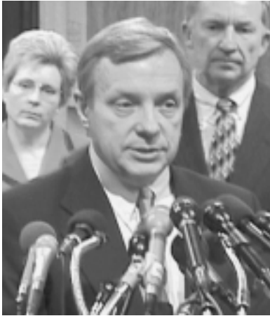
Sen. Richard Durbin (D-Ill.): "If there was unspeakable cruelty in those dimly lit prison cells [in Iraq], there was also a cruel process under way in the brightly lit corridors of power in Washington."

Attorney General "must have the independence necessary to be the nation's chief law enforcement officer." This position requires more independence than the Secretary of State, whose obligation it is to advance the President's interest abroad. "The bottom line is, it's hard to be a straight shooter if you're a blind loyalist," Schumer said.