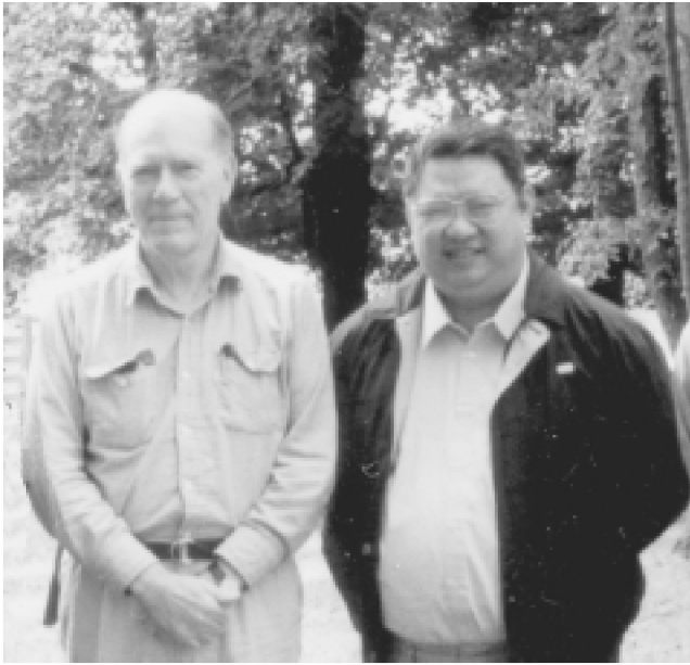
Butch Valdez (right) conducted this interview with Lyndon LaRouche from the Philippines, discussing the implications of the U.S. elections for the rest of the world. Here, the two met in Virginia earlier.

ning March 1933, to take measures to put the physical economy of nations back into functioning, and to re-design the monetary-financial system and the banking system to be able to continue that recovery. So, therefore, it is up to governments.