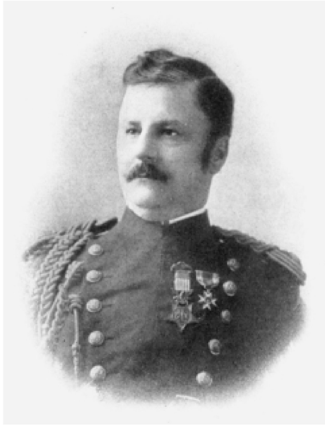
LaRouche pointed out that the Philippines is comparable to countries in Asia, like Japan or Korea “which has a potential, largely from its development since 1898, the development associated for example with the MacArthur period . . . it has the capability which very few other countries in the region have.” Show here is the father of Gen. Douglas MacArthur, Gen. Arthur MacArthur, who was military governor of the Philippines in the early part of the last century.

LaRouche: Well, I don't say Catholic, but Augustinian in the Catholic tradition of the Church. Because what happened was, you had a problem, which is the famous Council where the Emperor decreed that he was going to appoint the bishops of the Church, and this was a great corruption, under Constantine, of the Christian Church. There was a revolt among Christians of the Apostolic tradition, the tradition of the Apostles John and Paul, for example, against this Constantine corruption, of making the Christian church essentially a part of the Roman official cult collection. Augustine came to represent, as a convert away from what had been gnostic tendencies of that period—he became a leader to restore the tradition of the Christian Church as opposed to a Roman church. This led to a great struggle, where Isidore of Seville became a leader of this movement. It became known as an educational movement, the Augustinians, as also in the Philippines, are known as a teaching order. It moved from Spain into Ireland, of all places, among the Irish monks who Christianized the Saxons, and from this Christianization from Ireland and the British Isles—you wouldn't believe it, but at that time the British Isles were the center of Christianity—they converted people like Alquin, and created what became known as the Charlemagne system, which is the idea of a system of sovereign