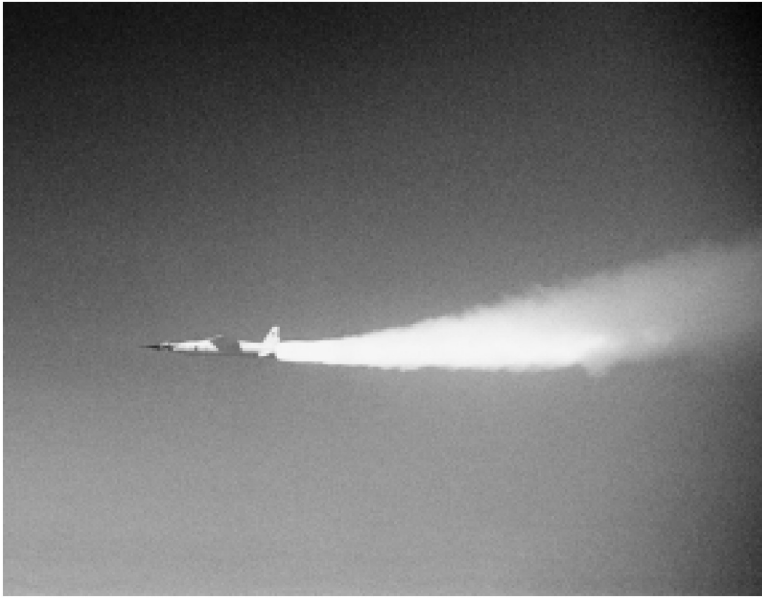
This shows a Pegasus rocket boosting the X-43A scramjet up to speed for the most recent Nov. 16, 2004 test of the scramjet, in which it maintained a speed of 6,600 miles per hour, a record for an air-breathing engine. "I pushed" scramjet development "because this is absolutely necessary for any intelligent approach to space which meets the needs of humanity back here on Earth," said LaRouche.

maybe not toward paradise, but certainly toward a great improvement.