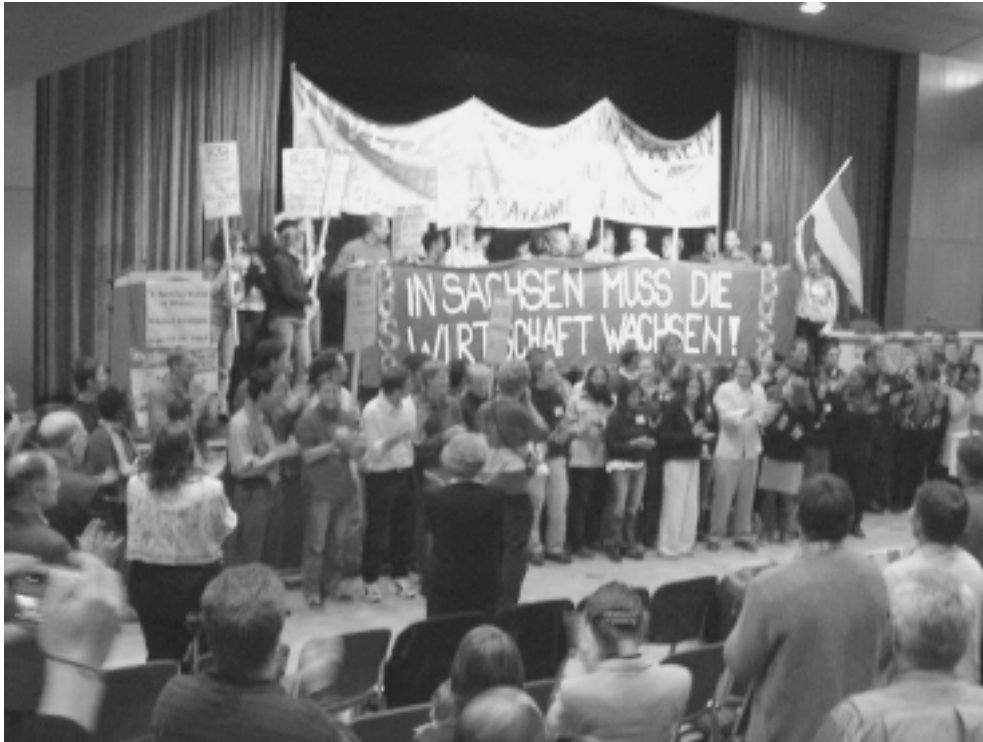
The LaRouche Youth Movement's singing gladdened hearts during the Saxony campaign, as it is doing worldwide. Here, the LYM's banner reads, "The economy must grow in Saxony"—the slogan which caught the imagination of the increasingly impoverished citizens of that eastern state, where the drive to topple communism began in 1989.

"No, no. We are all on holiday. We only come back in September. We will not do anything until September." But then came the beginning of August, and these people said, "Hey, wait a second. If the BüSo are the only ones who are doing this, they will absorb all the ferment, and we better do our own Monday demonstrations, or they will be the only ones capitalizing on this."