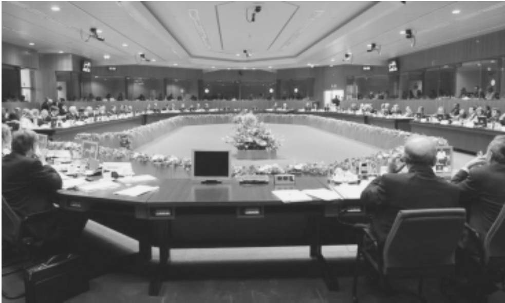
A European Council meeting in Brussels. The new Commissioners of the European Commission are all radical neo-cons or neo-liberals! "As long as these people have a say over the economy of Germany, of France, of Italy, and all these other European countries, there will be no recovery."

above all, the European Commission chief José Manuel Barroso, they are all for absolutely radical free-market policies.