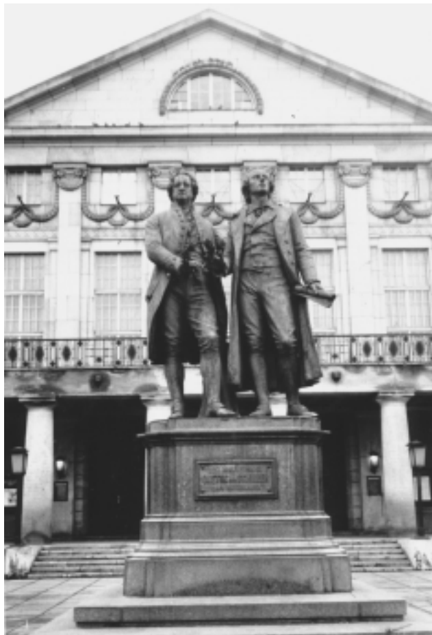
Statue of Goethe and Schiller in front of the theater in Weimar, in eastern Germany. "The only way we can give Germany back its soul, is through Classical culture."

Therefore, how do we unify Germany, really? How do we overcome the differences, which are the result of the two Germanys having belonged for half a century to two different blocs? Well, the only way, it can be done, is through the