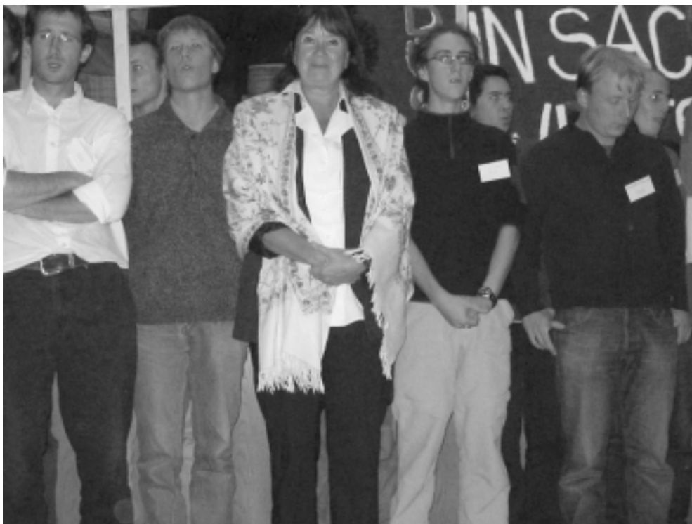
Helga Zepp-LaRouche with members of the youth movement. The real reunification of Germany, she stressed, will only occur on the basis of the highest level of Classical culture, the culture of Bach, Beethoven, and Schiller.

cons in respect to the Iraq War, she is proven completely wrong! She is basically, totally, untrustworthy, and has very poor judgment. Nobody should trust Merkel. If she's wrong on the Iraq War, she's also wrong on all other issues. And she was politically extremely stupid on the Hartz IV, in the Saxony and Brandenburg elections. She could have just kept her mouth shut, and let the SPD [Social Democratic Party] take the brunt for the policy. But, she had to outdo Schröder, and, you know, the result was very clear: The CDU lost 7% in Brandenburg and they lost 15% in Saxony.