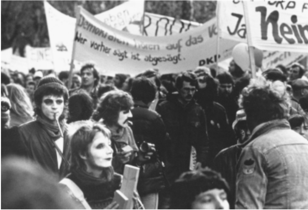
The children of the Frankfurt School and the Congress for Cultural Freedom: The radical-ecologist and terrorist movement in Germany is dedicated to destruction of the social state and the industrial potential of the nation. Their Green ideology is the left-wing version of Nazi jurist Carl Schmitt's fascism.

dom, together with the Frankfurt School project, was the idea to cut the populations of Europe and the United States off from its tradition in Classical culture.