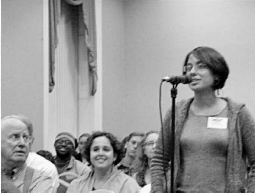
Questions to the candidate came from many of the more than 100 LaRouche Youth Movement organizers in Boston for the Convention, and others they had brought to the event.

and they are wrong.” We can not let this country go to Hell, out of spite and anger, against their foolishness. This is our country! It belongs to us, historically—not to them! And, we have to defend it. We have to defend it through the institutions of government, which were created, in a republic and a Constitution which is the oldest in the world. No Constitution of any other nation has lasted as long as the Constitution of the United States! This is the finest system of government which has ever existed on this planet, despite some of the rogues and thieves that have taken over and run it. This is the nation, under whose Constitution the world was saved from a depression; the world was saved from the threatened empire of world Nazism.