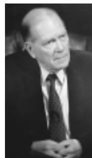
EIR Contributing Editor, Lyndon H. LaRouche, Jr.

gives subscribers online the same economic analysis that has made EIR one of the most valued publications for policymakers, and established LaRouche as the most authoritative economic forecaster in the world.