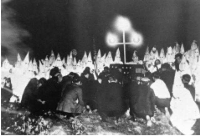
A Klan cross-burning: The Fugitives circle represented a sort of merger between the KKK and Britain's Fabian Socialists, a meeting of the minds.

needs artificial respiration is the attitude of resistance on the part of the natives to the salesmen of industrialism. It will be fiercest and most effective if industrialism is represented to the Southern people as—what it undoubtedly is for the most part—a foreign invasion of Southern soil, which is capable of doing more devastation than was wrought when Sherman marched to the sea.”