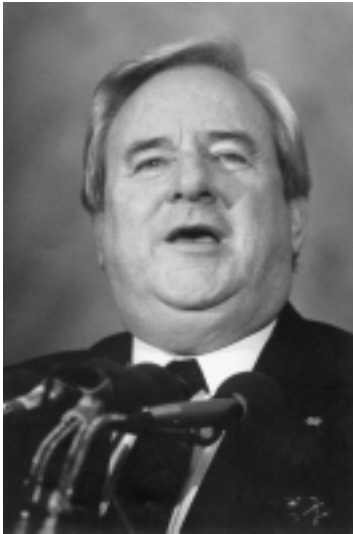
The Rev. Jerry Falwell, one of the “Christian Zionist” movement’s leaders.