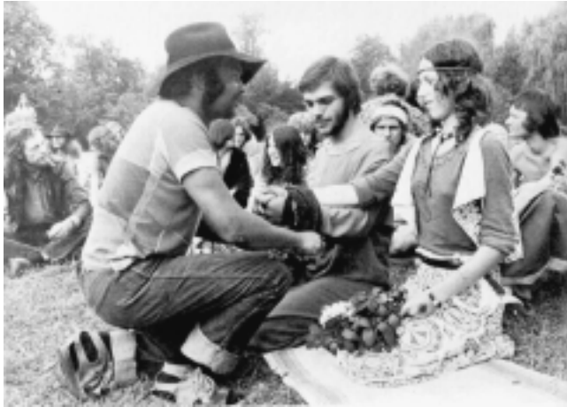
The traumatic events of the 1960s—from the 1962 Cuban Missile Crisis to the 1963 assassination of President John F. Kennedy and the later assassinations of Malcolm X, Dr. Martin Luther King, and Robert F. Kennedy; to the urban race riots and the war in Indo-China—transformed the Baby Boomers from an optimistic, future-oriented generation, into irrationalist, babbling counterculturalists and drug abusers.

the same credo, promulgated by British Fabians G.K. Chesterton and Hilaire Belloc, was later translated into “Tradition, Family, Property.”