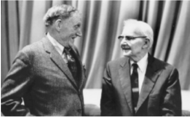
Robert Penn Warren (left) and John Crowe Ransome, among the key figures of the pro-Confederate, pro-slavery, pro-fascist Fugitives network.

As the founding chairman of Harvard University's Psychology Department, James helped launch a new dimension of religious insanity, beyond the earlier episodic "Great Awakenings." In a famous series of lectures at Edinburgh University, published under the title Varieties of Religious Experience , he proposed that Edwards' type of terror-induced "religious experience," be enhanced with drugs. "Borderland insanity, crankiness, insane temperament, loss of mental balance, psychopathic degeneration," he argued, were necessary for creative thought, including a sense of the spiritual. He pointed out that drunkenness has been traditionally the best way to "get religion," but added the suggestion that nitrous oxide, ether, and other drugs ought also to be used.